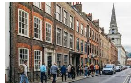
One of GTG Abroad recommendations — London’s Jack the Ripper Walking Tour.

The goal, they said, was to grab the attention of all young travelers, not just in the United States but globally. Another recent initiative, one designed to monetize the service, has been the launch of GTG Abroad’s Elite Member Portal. Built on a subscription model, members can “buy in” and receive major incentives not found on the regular website, which is free and available to all. Priced at $49.99, those incentives include a coupon book with more than $1,000 worth of discounts