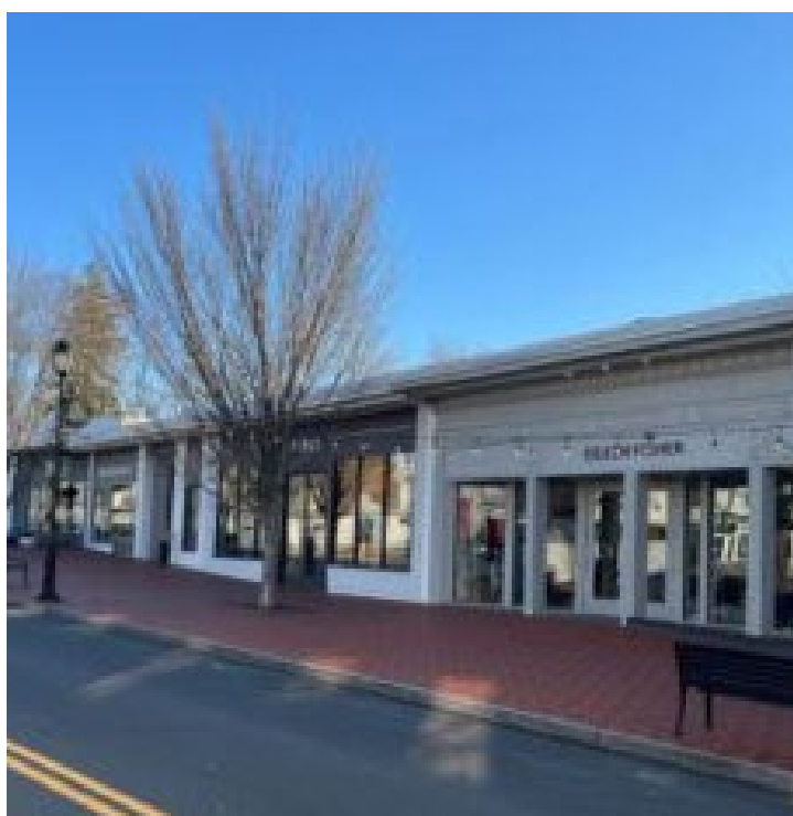
The retail center at 160-184 Main St. in downtown Westport was sold to a Fairfield investor for $12.3 million.