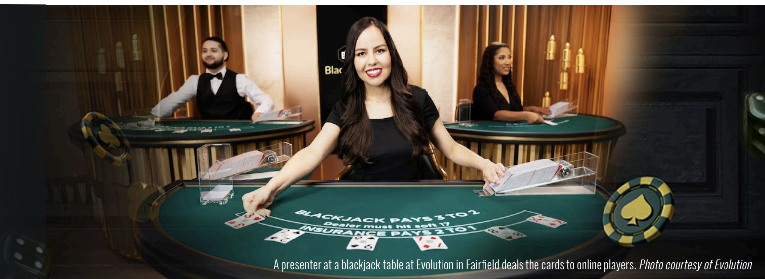
A presenter at a blackjack table at Evolution in Fairfield deals the cards to online players.

BY GARY LARKIN / glarkin@westfairinc.com