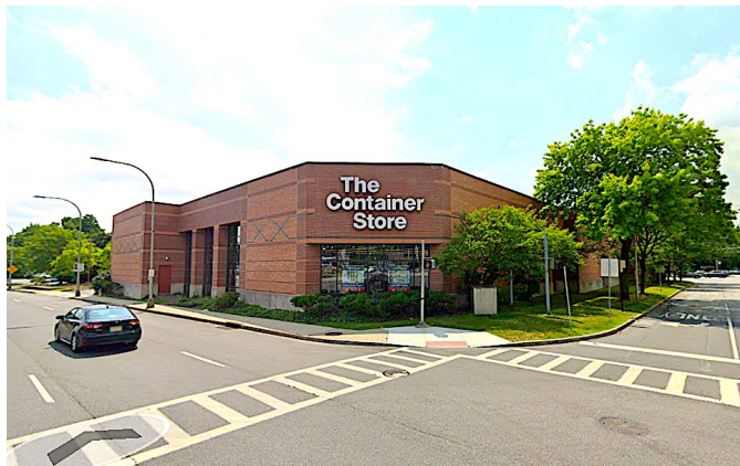
The Container Store in White Plains.

The Container Store Group, Inc., which operates 102 Container Store outlets in 34 states including the District of Columbia, has filed for Chapter 11 Bankruptcy protection in the United States Bankruptcy Court for the Southern District of Texas. The chain says that it expects to keep all of its stores open while the proceeding unfolds, and that would include the stores in White Plains and Yonkers. The Yonkers store is in Ridge Hill. The White Plains store is at the intersection of Bloomingdale Road and Westchester Avenue.