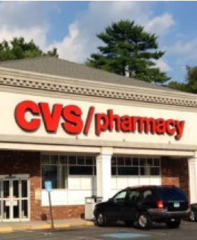
CVS Health, which is based in Hartford, has announced another round of layoffs. File photo.