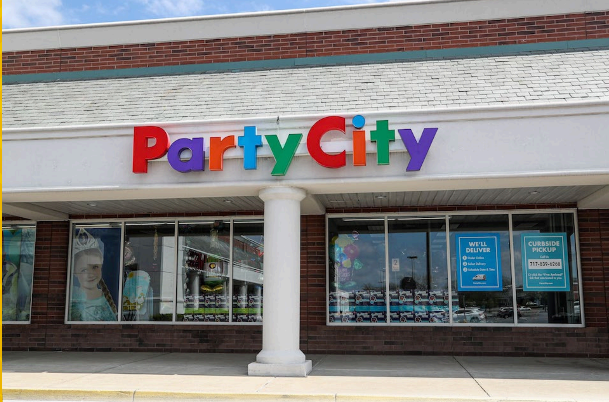
Party City store.