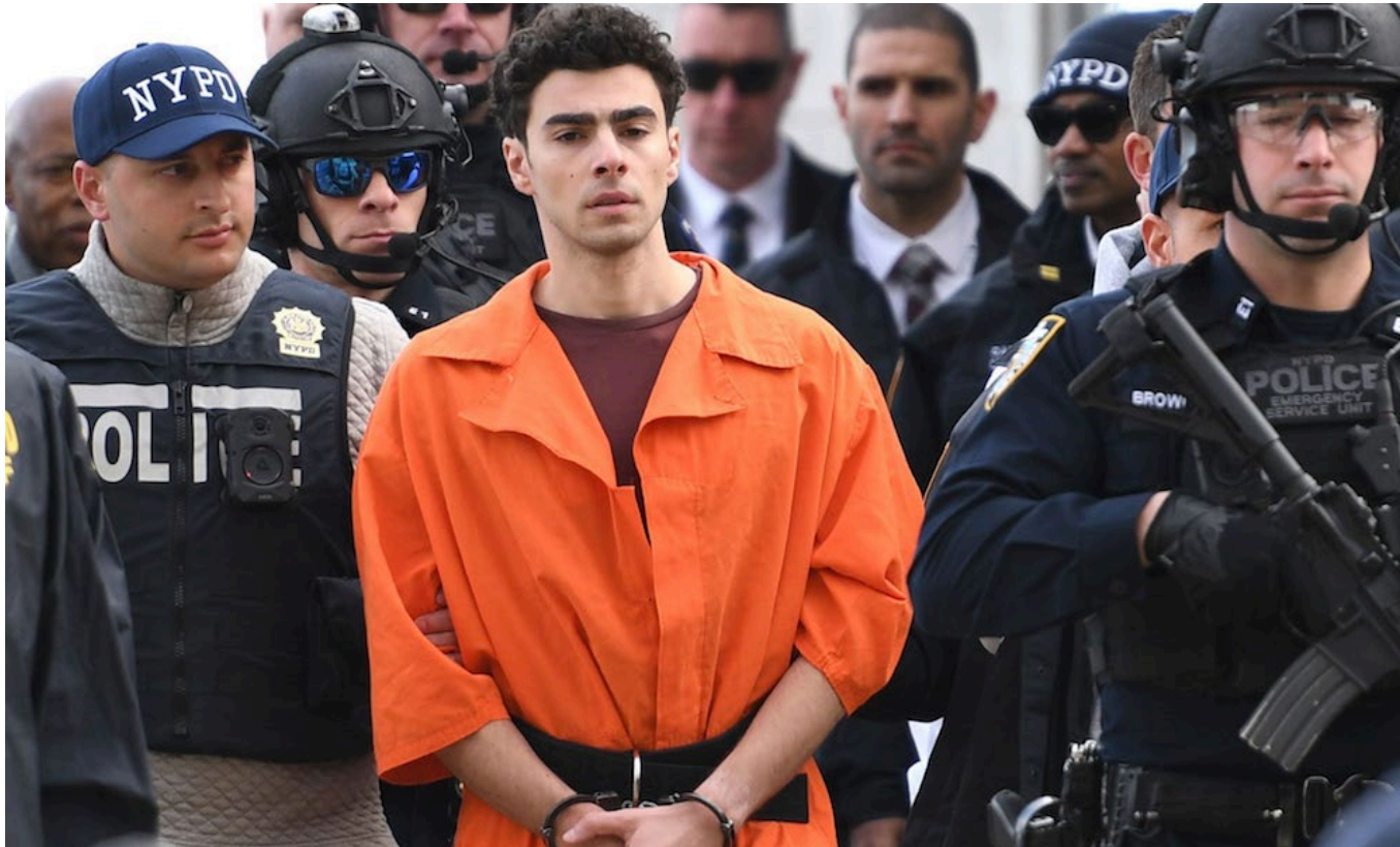
Mangione entering Manhattan court Dec. 23.

"The killing unleashed what some observers describe as Americans' pent-up anger and frustration with the nation's health insurance industry."