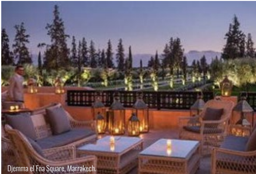
Djemma el Fna Square, Marrakech.