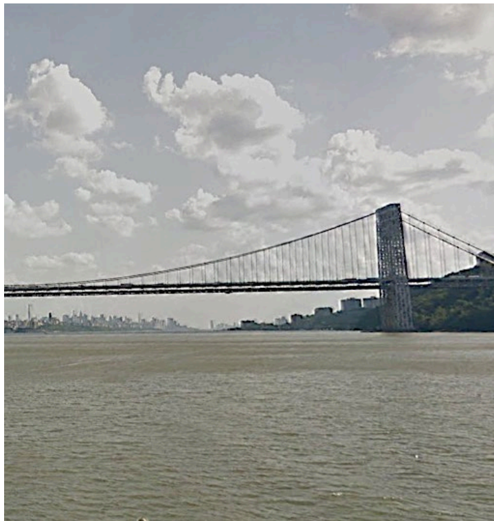
George Washington Bridge.

Motorists heading into the Central Business District of Manhattan at 60th Street and below will begin paying Congestion Pricing tolls on Jan. 5 following the Federal Highway Safety Administration today giving final approval to the toll plan.