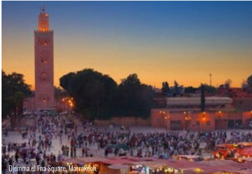
Djemma el Fna Square, Marrakech.