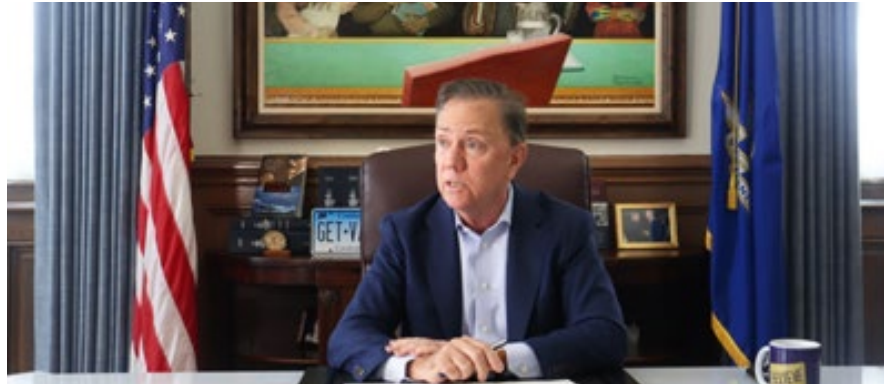
Gov. Ned Lamont recently announced the state's workers' compensation premiums have dropped for an 11th straight year.

post-2020 economic pattern of high early year growth for six months that weakens towards the end of the year,” the commissioner said. “Even with monthly ups and downs, our economy is stable with major economic drivers like healthcare continuing to hire and expand. It's worth noting that from October 2023 to October 2024 a total of 8,300 jobs were added to employer payrolls — 7,700 of which were in healthcare.”