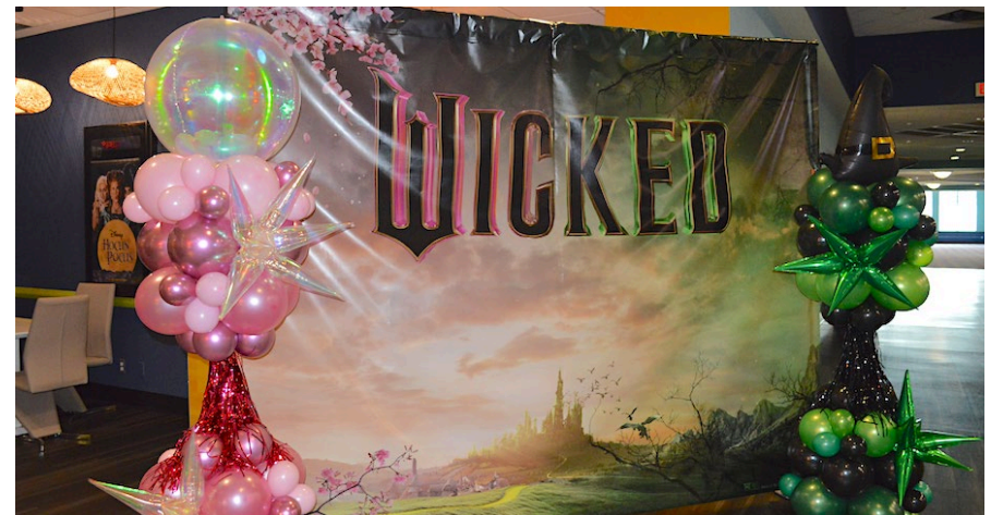
"Wicked" display at Apple Cinemas in City Center.