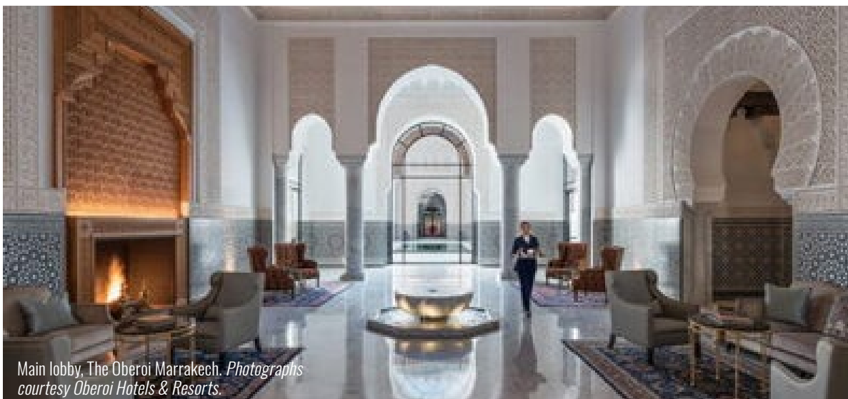
Main lobby, The Oberoi Marrakech.

"The Oberoi Marrakech: A serene escape just beyond the city's vibrant chaos, where luxury, culture, and tranquility meet amidst snow-capped Atlas Mountains and lush olive groves."