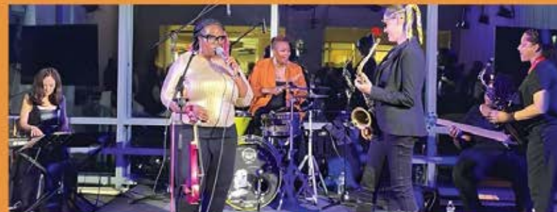
SAGE ALL LADIES JAZZ & BLUES ENSEMBLE