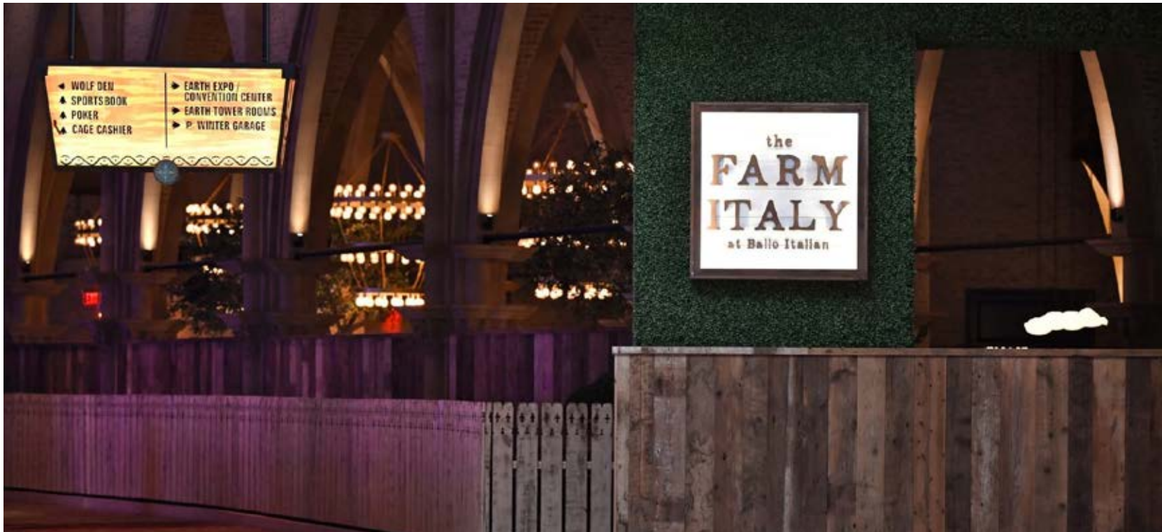
The Farm Italy at Mohegan Sun.