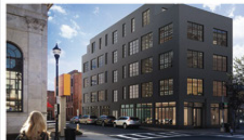
CORNER BUILDING IN HEART OF PORT CHESTER FOR SALE | 125 N Main Street | Port Chester, NY Listed by Michael Rackenberg | $4,650,000