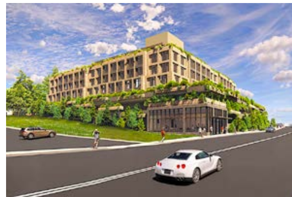
Rendering of 250 Boston Post Road, Port Chester..

The owner of 250 Boston Post Road in Port Chester, Steven Brauser, has joined with Scott Aaron of Socius Development in proposing to build a residential building with 120 apartments on that property. The application is from the entity 250 Boston Post Road LLC. The developer presents the building as being 4-1/2 stories, an average height based on the slope of the terrain. Village staff in reviewing the proposal suggested that it could be classified as being seven stories, with four stories of residential and three parking levels.