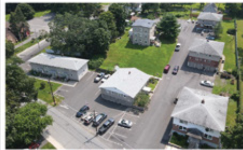
FREE MARKET APARTMENTS | 6 BUILDING PORTFOLIO FOR SALE | Clinton Street Apartments | Cornwall, NY Listed by T. Gorman & M. Scrima | $5,500,000