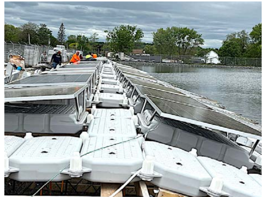
Floating solar array under construction in Cohoes, NY.