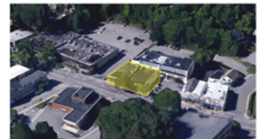
PRIME RETAIL CORNER OF BUILDING WITH HUGE WINDOWS & PARKING FOR LEASE | 200 E. Main Street | Mount Kisco, NY Listed by Darren Gordon | $42.00 SF/Yr

800 WESTCHESTER AVENUE, RYE BROOK, NEW YORK 10573 914.798.4900 | HOULIHANLAWRENCE.COM/COMMERCIAL