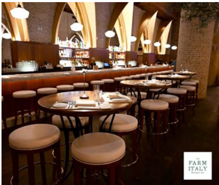
High tables at The Farm Italy Mohegan Sun.