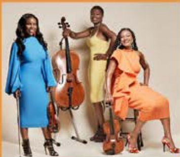
THE STRING QUEENS

LABOR DAY WEEKEND 2025 THE VIBE, THE VIEW, THE VINEYARD AUGUST 29 TO SEPTEMBER 1