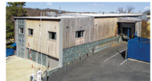
TWO OFFICE SPACES AVAILABLE WITH LUXURY FINISHES | SF : -3,500 FOR LEASE | 28 Potter Avenue | New Rochelle, NY Listed by Jared Stone | $22 PSF MG + Utilities