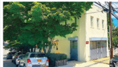
RIVERDALE RETAIL / OFFICE 7.88% CAP RATE FOR SALE | 5751 Mosholu Avenue, Bronx, NY Listed by Daniel Hickey | $950,000