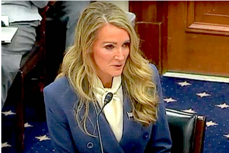
SBA Administrator Kelly Loeffler during questioning by Latimer.

During a hearing by the House Small Business Committee, Rep. George Latimer of New York's 16th Congressional District pressed Kelly Loeffler, administrator of the Small Business Administration (SBA), for answers to questions his small business constituents have been asking, but she avoided providing specifics.