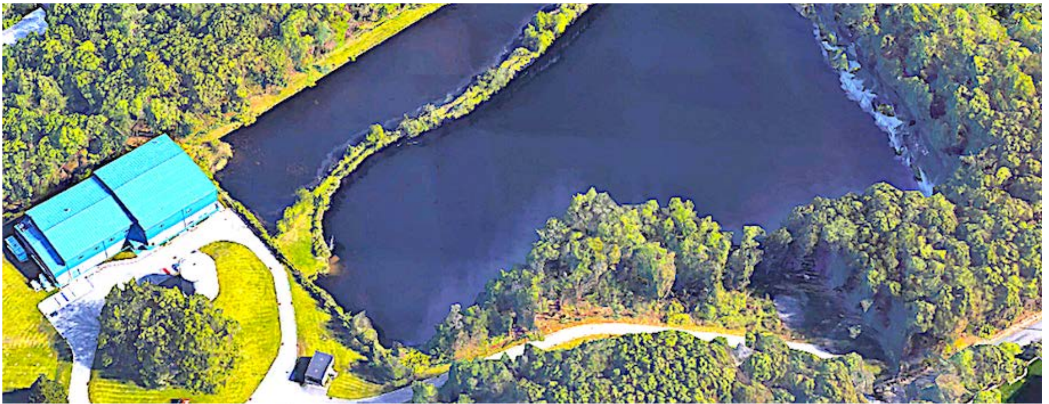
Camp Field Reservoir, Peekskill.