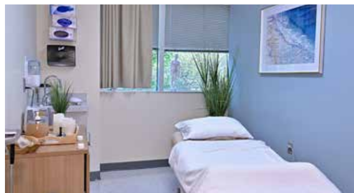
A treatment room in Phelps Hospital's new Health and Wellness Center.

"It embodies our deep commitment to treating the whole person, not just the disease."