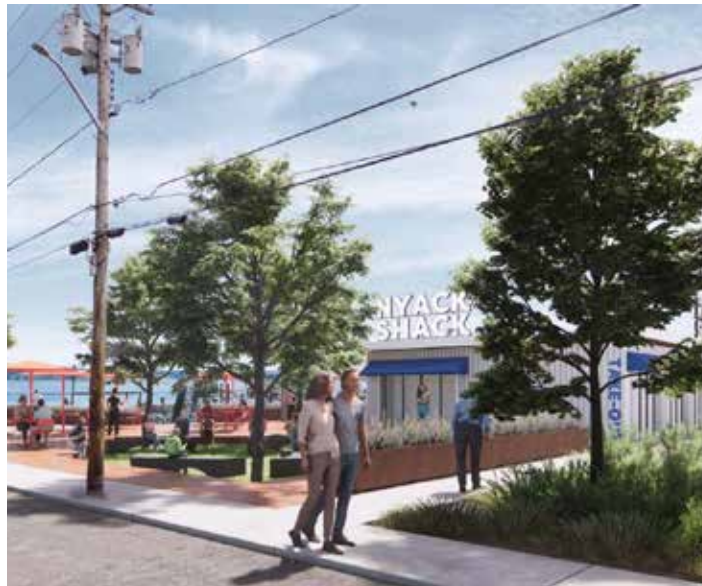
Rendering of improved waterfront in Nyack.

“With these investments, Mid-Hudson Valley residents can expect upgraded civic, commercial and cultural spaces.”