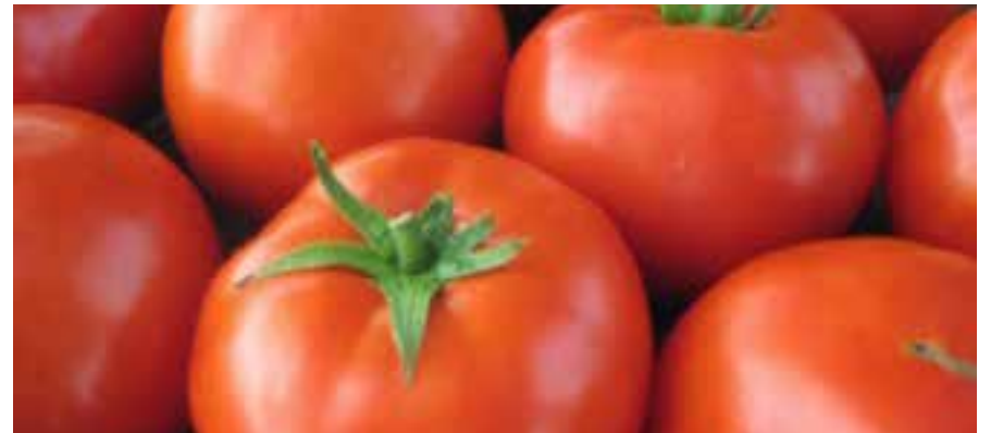
A single tomato plant can produce an average of 8 pounds or more of tomatoes.

“Take time to do a bit of planning. Your first trip to the garden center can result in buying more plants than the space and time you have available.”