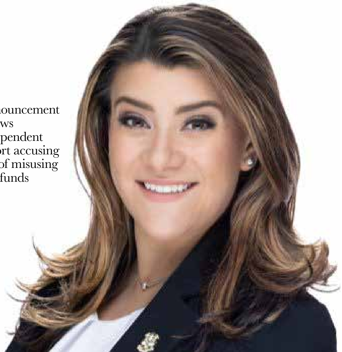
Former New Britain and Republican gubernatorial candidate Mayor Erin Stewart

Announcement follows independent report accusing her of misusing city funds