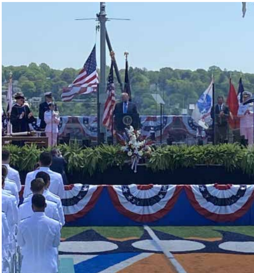
President Donald Trump delivers the keynote address at the US Coast Guard Academy commencement on Wednesday, May 20.

“We thank the president for presiding over our ceremony and for the strong support he has shown for our services. And we are privileged to welcome him back to our 103-acre campus along the Thames River, where we build leaders that will defend our maritime borders, secure our nation’s interests and project our American maritime strength, prosperity at sea and around the globe.”