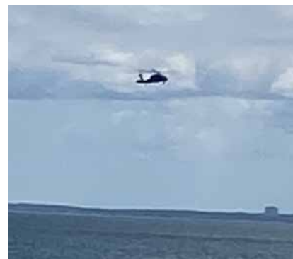
A modern day Sikorsky helicopter hovers over the spot of the first ever hoist air rescue in 1945 on the Penfield Reef.