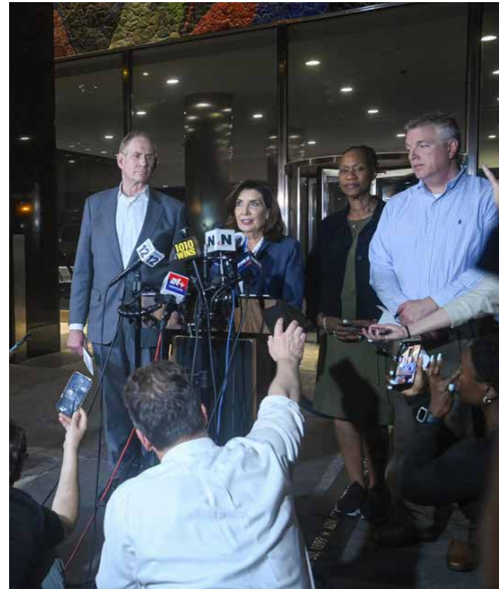
Hochul announces end to LIRR strike.