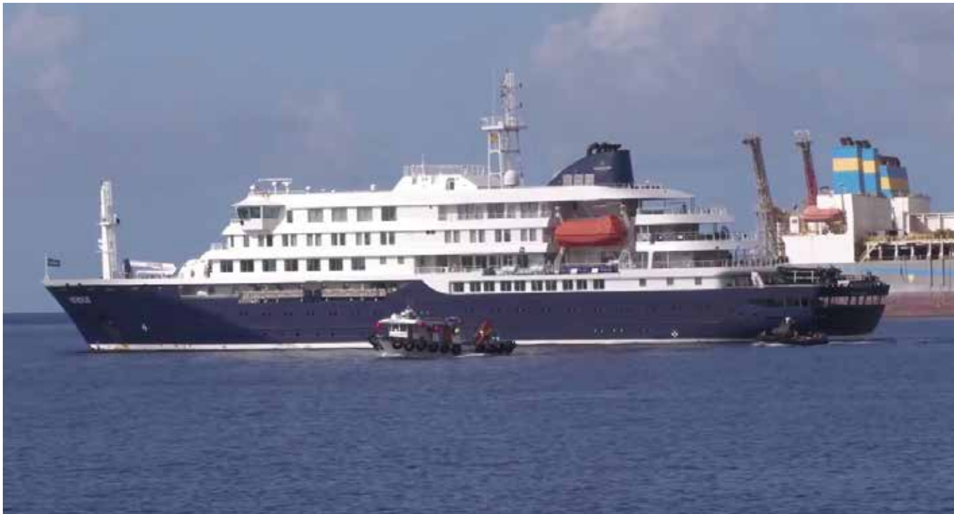
The MV Hondius, site of a recent hantavirus outbreak, in the Canary Islands port of Granadilla May 10.

The Dutch cruise ship MV Hondius – site of an April outbreak of the Andes subtype of hantavirus, which infected 10 people and killed three – has returned to the port of Rotterdam for deep cleaning. Meanwhile, passengers have been evacuated, repatriated and, if exposed to the virus, quarantined, with 16 Americans being monitored at the University of Nebraska Medical Center’s National Quarantine Unit in Omaha and two at Emory University Hospital in Atlanta.