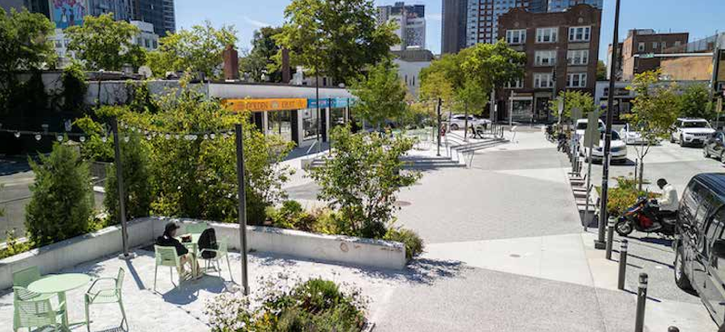
The City of New Rochelle hopes its expansion of its homeownership down payment program will bear fruit in the city. File photo