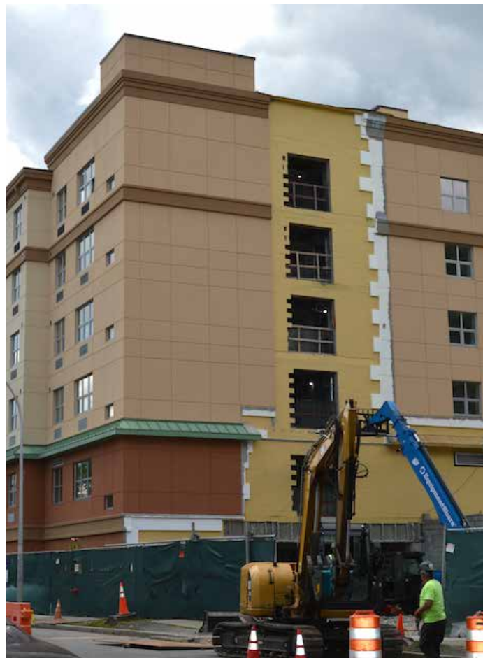
Mt. Hope Plaza under construction in White Plains on June 1.

"We believe this shared approach best reflects our mutual commitment to