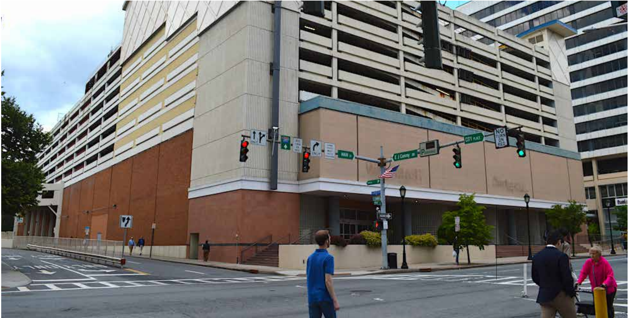
275 Main St., White Plains.

The New York City-based real estate and investment company Argent Ventures through a related entity is asking White Plains for a zoning change that would allow it to reactivate space in the building at 275 Main St. where Walmart had been located.