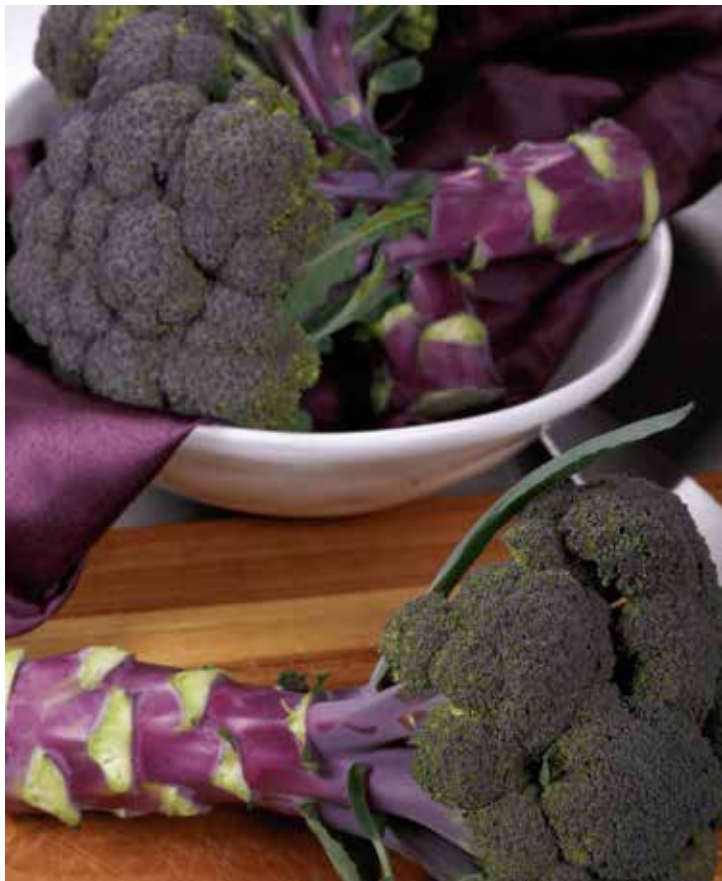
Purple magic broccoli adds color and interest to gardens and meals.

Fill your crudité platters with vegetables grown in your own garden and containers. Arrange the raw vegetables neatly on a platter or board and add a homemade dip seasoned with fresh herbs. Your family and guests are sure to enjoy the selection and fresh flavor.