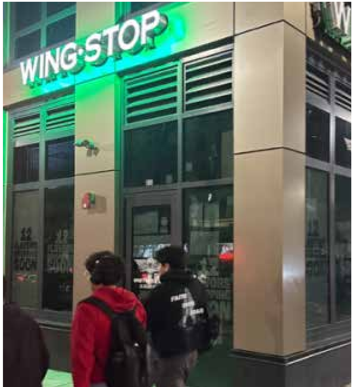
Wingstop New Rochelle.

“In some ways, yes. You have systems; you have a team; and you have a track record that helps with everything from landlords to lenders. But each new location has its own challenges. The honest answer is that the complexity scales with the portfolio. You get better at managing it, but you never stop earning it.”