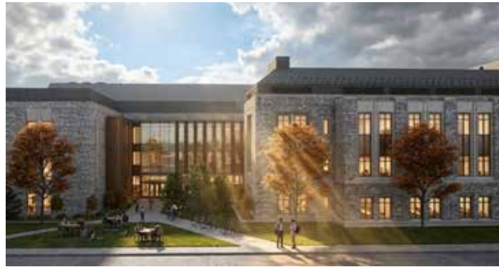
Rendering of newly proposed Marist building.

The university said it has started taking necessary steps to add a new nursing curriculum, pending state approval, in addition to a physics major that would lead into engineering programs in collaboration with other universities.