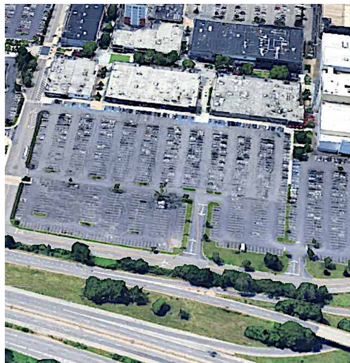
Area at Cross County Center where new construction is taking place.