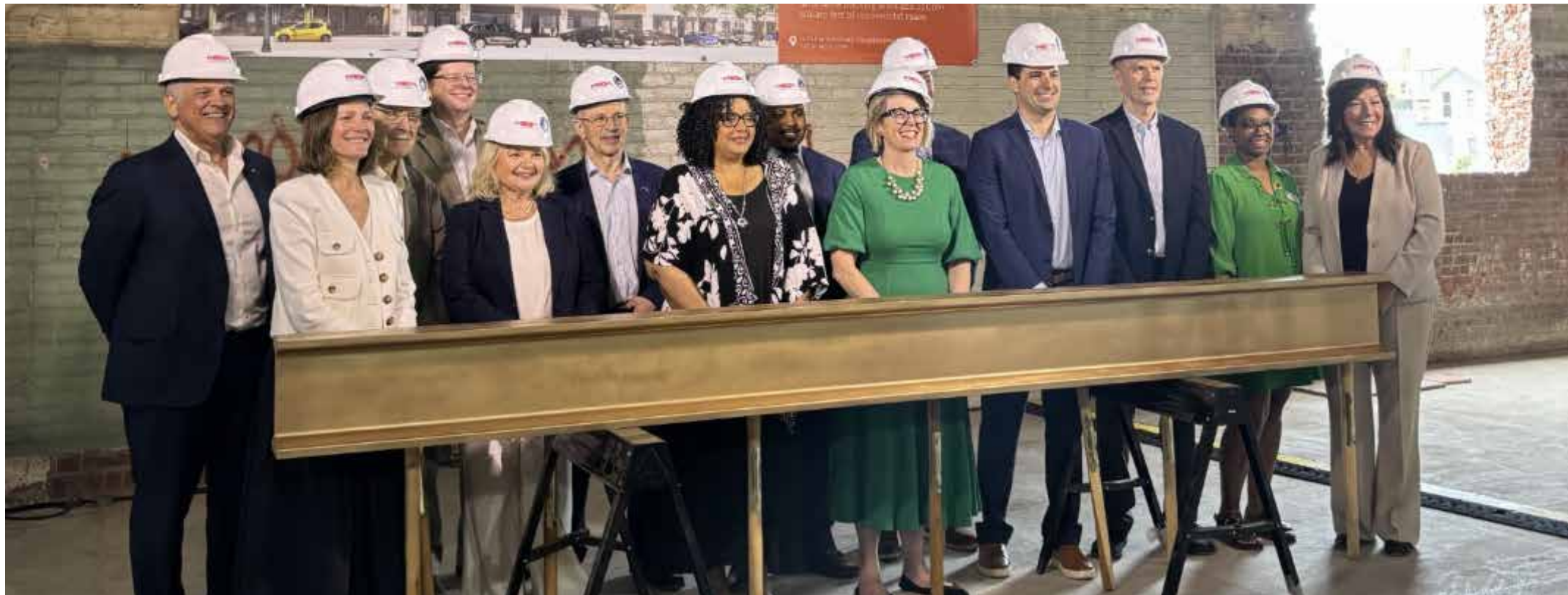
Officials gathered to mark the start of construction on Wallace Campus.

Construction has begun on the $147 million, 187-unit mixed-use affordable housing development in the city of Poughkeepsie known as Wallace Campus. The project on Poughkeepsie's Main Street involves the transformation of the long-vacant Wallace Department Store into residences along with construction of two new buildings.