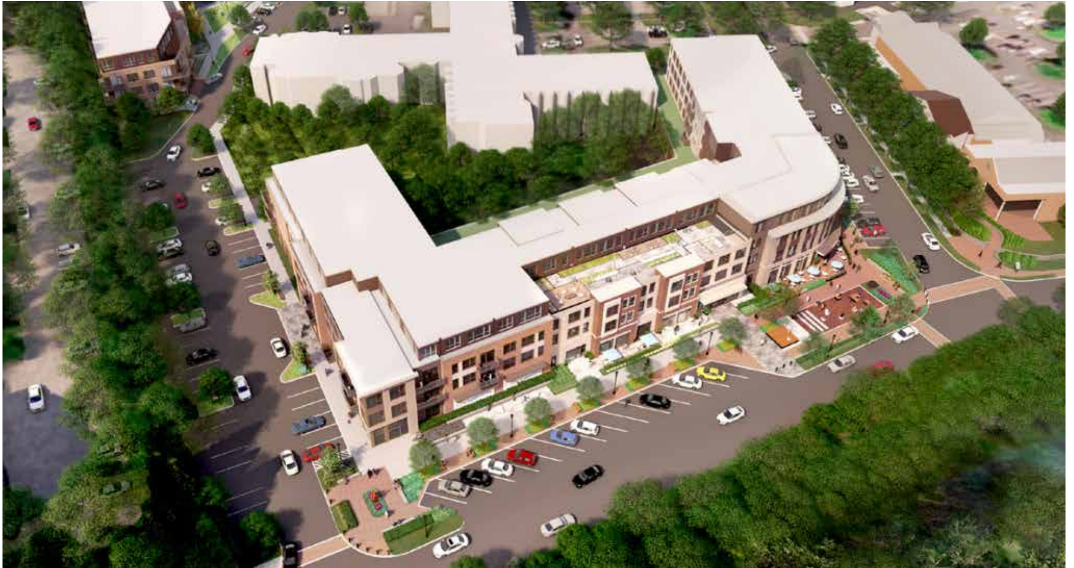
Aerial rendering of Wilton Campus 1691, LLC's River Road property.

The entity Wilton Campus 1691, LLC has made a pre-application submission to the Town of Wilton for a four-story 175-unit multifamily building it wants to construct as Phase II of a development on property it owns at 15 and 21 River Road. The property covers approximately 12.2-acres. It was not immediately clear when review of a formal application might begin.