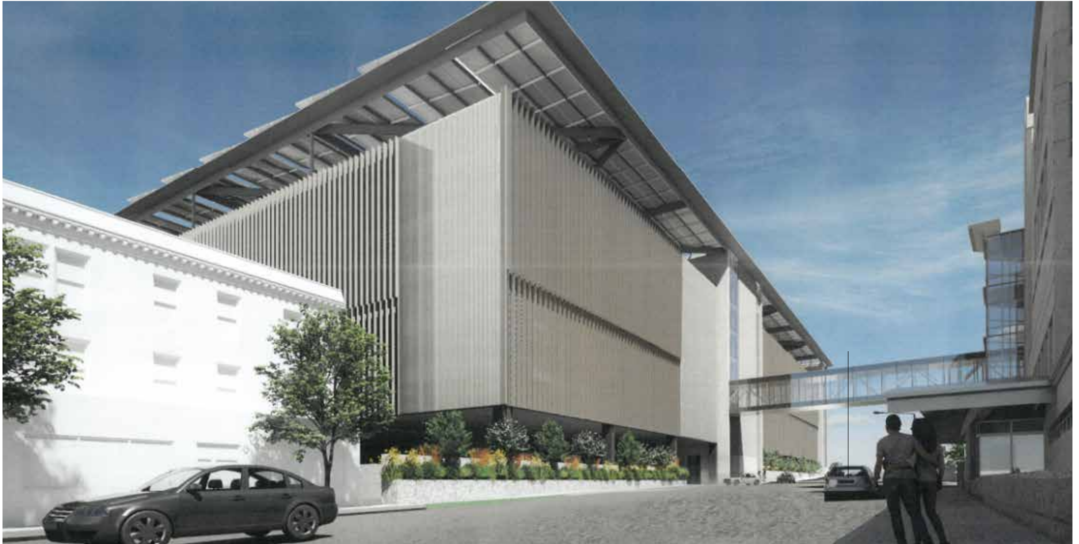
Rendering of White Plains Hospital proposed garage looking east on East Post Road and showing pedestrian bridge connecting to hospital.

The Westchester County Industrial Development Agency (WIDA) has voted to grant final approval of financial assistance for the construction a new 1,950-space parking garage on East Post Road in White Plains to serve White Plains Hospital and residents of the White Plains Housing Authority's Brookfield Commons.