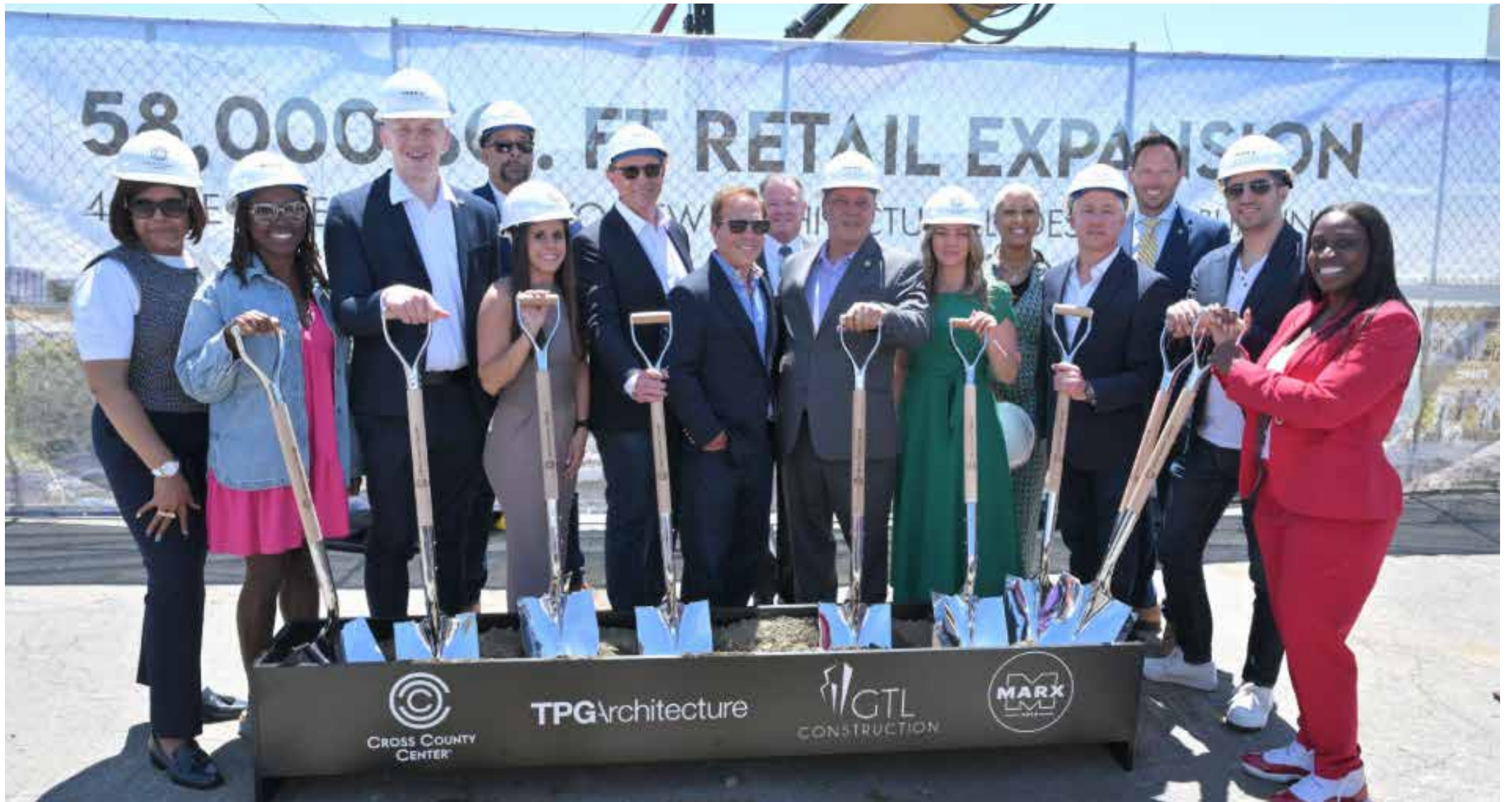
At the groundbreaking for Cross County Center project.

The start of construction on two new retail buildings, a parking garage and a park at the Cross County Center in Yonkers was marked with a groundbreaking ceremony attended by Yonkers officials, executives from Marx Realty, community leaders and other invited guests.