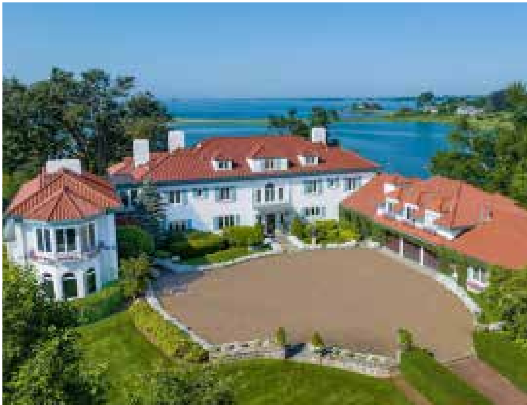
The home of Kathie Lee Gifford at 108 Cedar Cliff in Riverside has been listed for $100 million by Sotheby's International Realty.