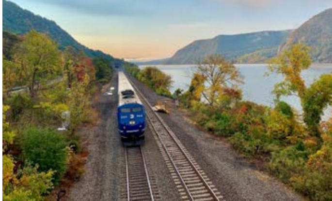
Metro-North train on Hudson Line.

Eighteen state senators have gotten together to urge Gov. Kathy Hochul to follow-through on a plan for Metro-North to expand service beyond Poughkeepsie that was supposed to have already begun but has been on hold. With Amtrak restoring service between New York City and Albany that has a few stops in the Hudson Valley, Metro-North's planned expansion beyond Poughkeepsie was shelved.