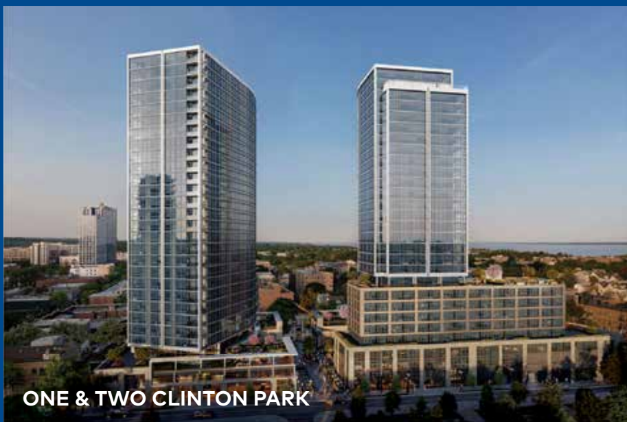
ONE & TWO CLINTON PARK

The Cappelli Organization and its subsidiaries, Cappelli Development and LRC Construction, are prominent leaders in real estate development and construction in the Northeast with a 45-year track record of proven excellence. From concept to completion, we bring a unique and well-rounded perspective to every project we oversee.