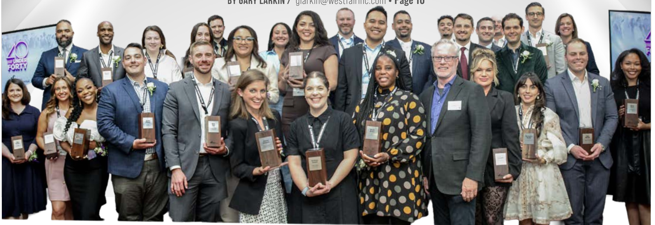
Presenting the 2026 Class of Westfair Business Journal's 40 under Forty.