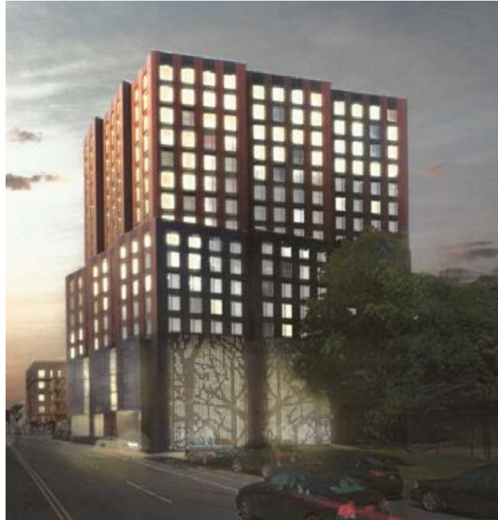
Rendering of 636 South Broadway Partners LLC's proposed building.