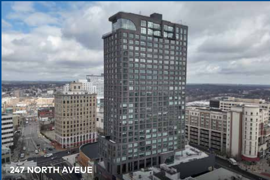
247 NORTH AVEUE