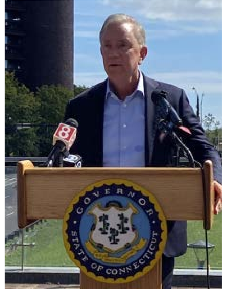
Gov. Ned Lamont.

“We look forward to continuing to work in partnership with state leaders to build on this progress and ensure long-term fiscal stability for all of our communities,” he said.