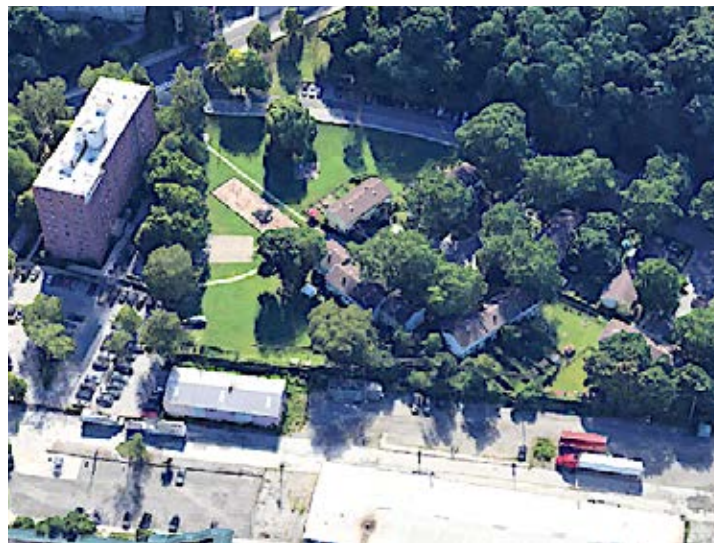
Franklin Courts in Tarrytown.

A separate community building is planned that will include a lounge, fitness center and a game room. There will be on-site laundry services in each building. The grounds will also include seating areas, walking trails, a playground and a multipurpose paved area for sports.