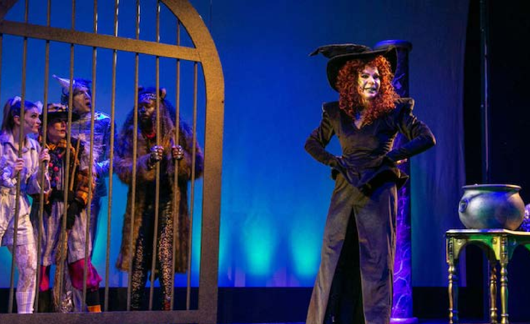
"The Wizard of Oz" was just one of a litany of plays and musicals that were produced at Bridgeport's Downtown Cabaret Theatre. It will close for good in June after "A Chorus Line" finishes its run.