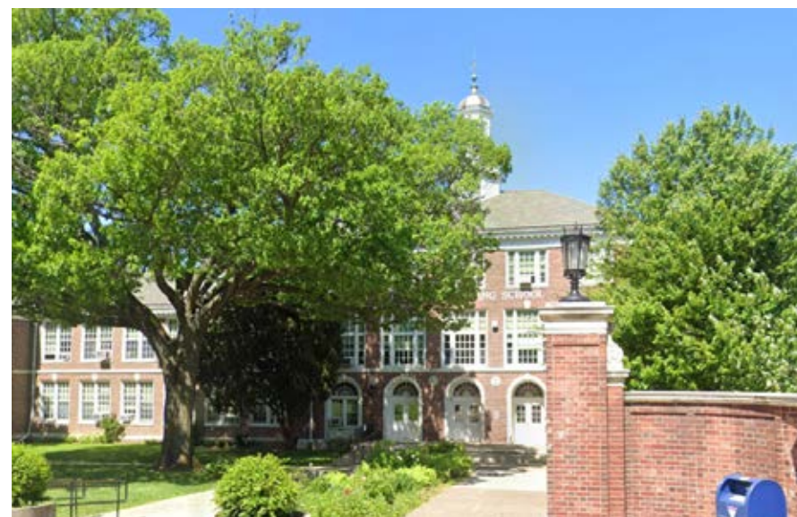
Washington Irving School.

fit from modernized and healthier learning environments as we progress toward a cleaner future for the next generation," Gov. Kathy Hochul said.