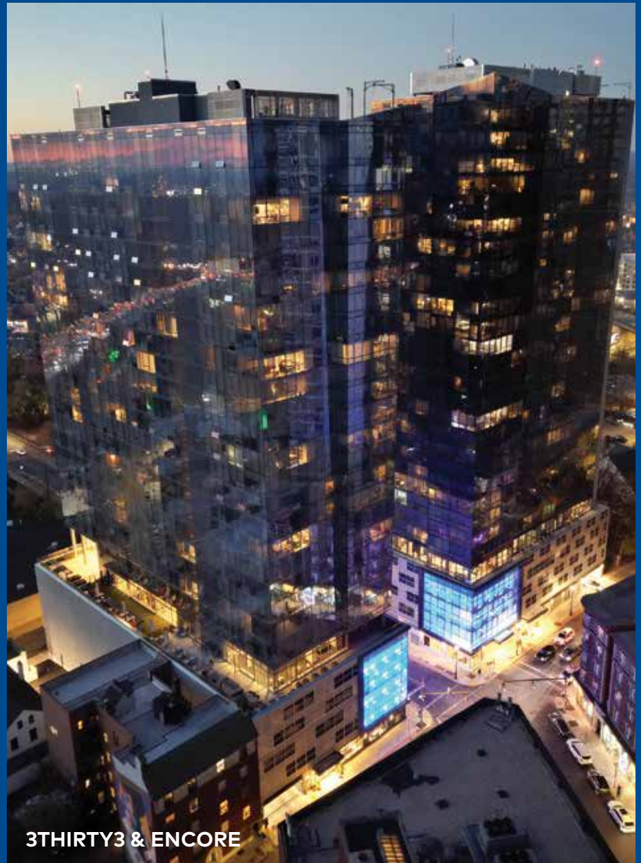
3THIRTY3 & ENCORE