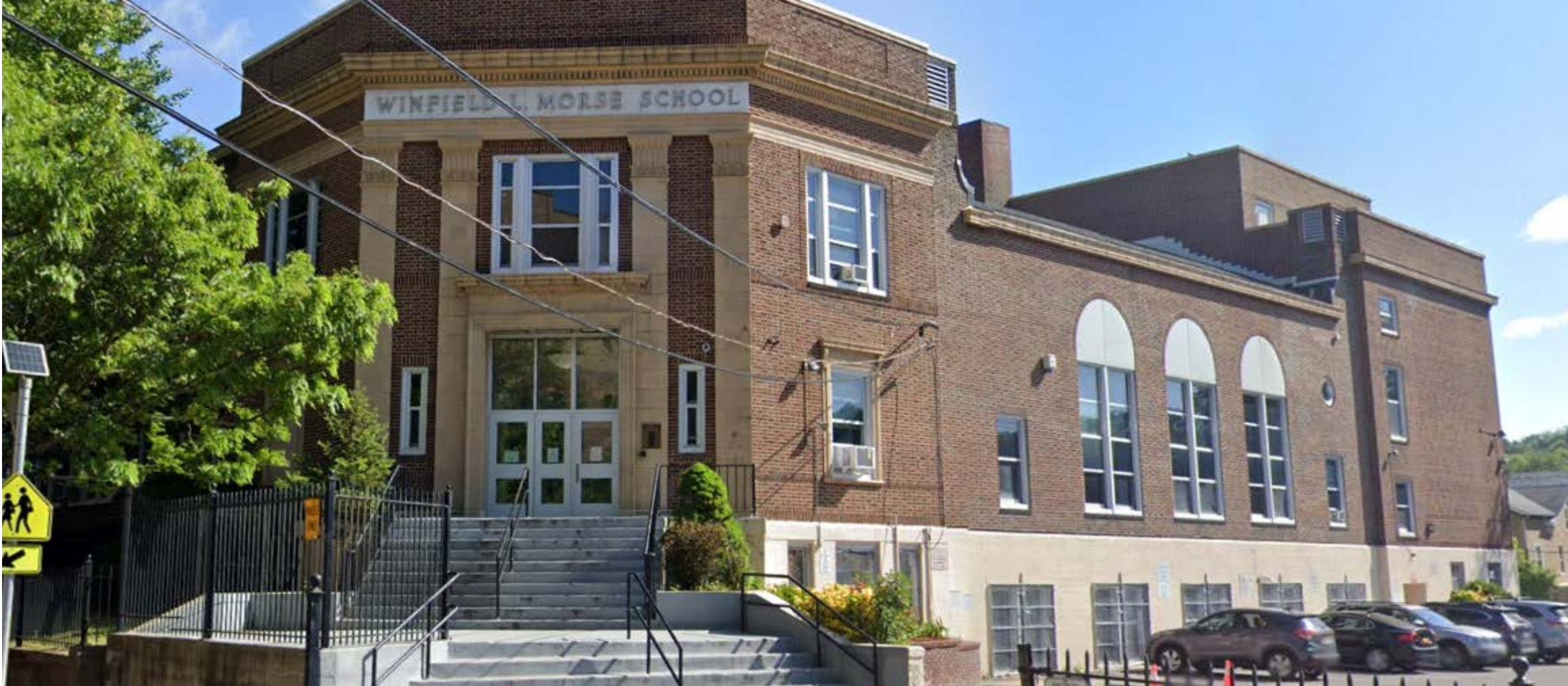
Winfield L. Morse School.