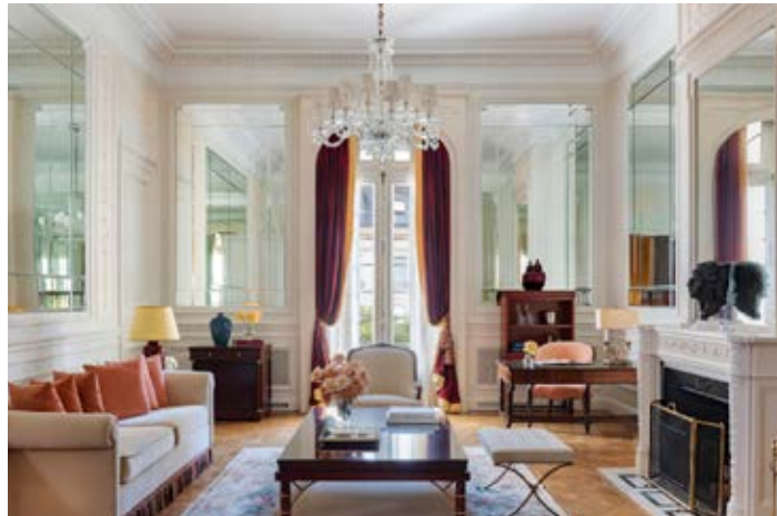
▲ Presidential Suite at La Mansión Álzaga Unzué.

But my choice is Four Seasons Hotel Buenos Aires, 25-years-old this year but still lording it over the competition. On the edge of the tony Recoleta district, the subtly horsey, polo-themed property — polo and the raising of polo stars and ponies being another national pastime — has a swimming pool that's a treasure (and the only heated outdoor pool in Recoleta). That alone might be reason enough to stay here.