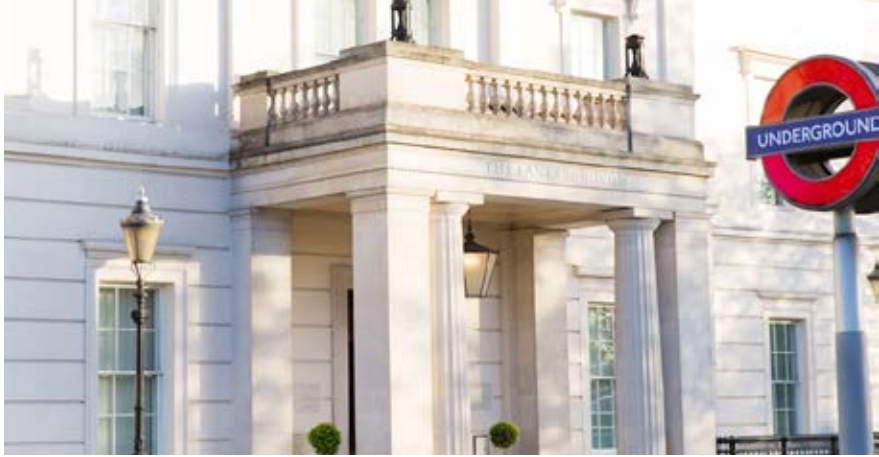
The Lanesborough, London.

BY GEORGETTE GOUVEIA / ggouveia@westfairinc.com