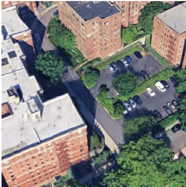
Parking lot at 98 Broad Parkway.