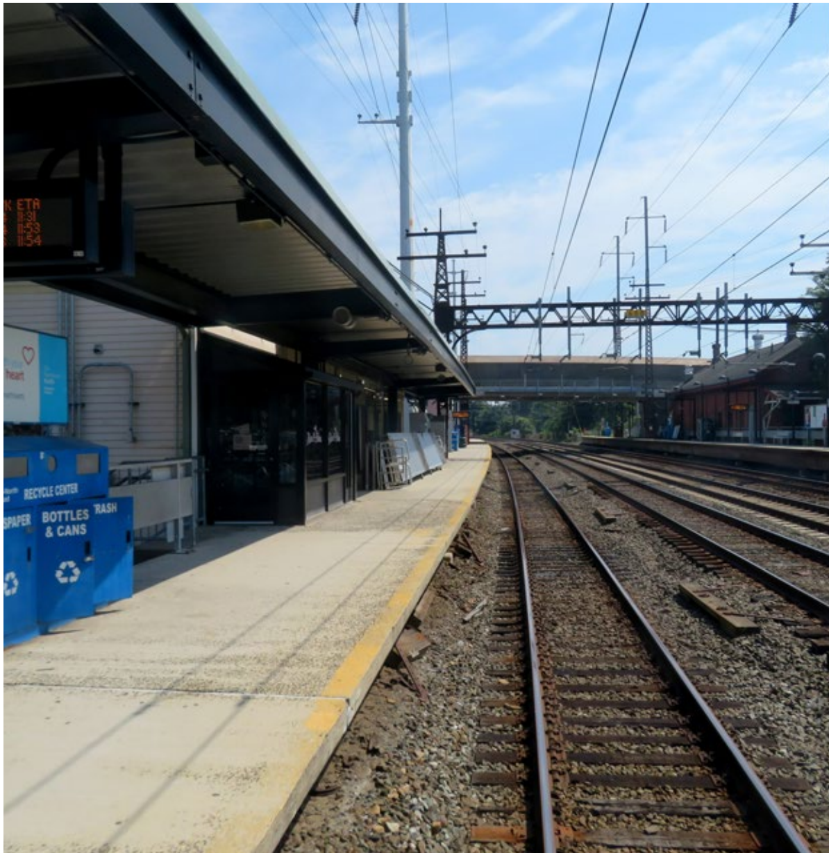
The downtown Fairfield train station.

BY GARY LARKIN / glarkin@westfairinc.com