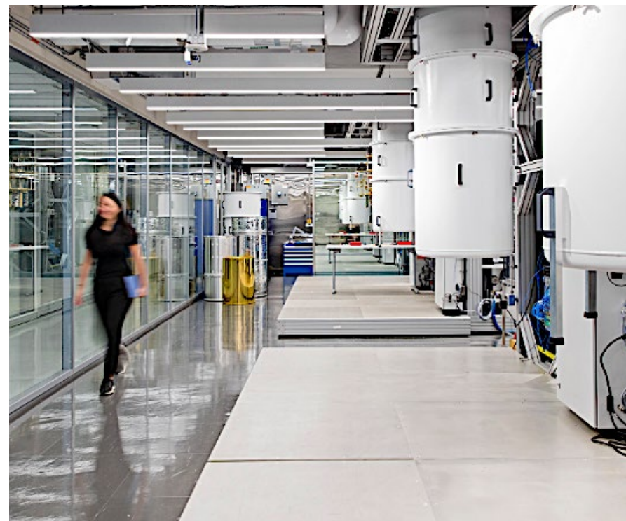
IBM Quantum lab in Yorktown Heights.

— Arvind Krishna, IBM Chairman, President and CEO