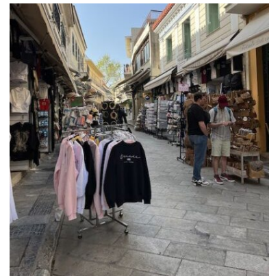
The Plaka -- or Plaka, as the locals call it -- is a place for dining and souvenirs in the heart of Athens.