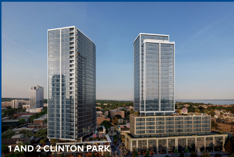
1 AND 2 CLINTON PARK

The Cappelli Organization and its subsidiaries, Cappelli Development and LRC Construction, are prominent leaders in real estate development and construction in the Northeast with a 45-year track record of proven excellence. From concept to completion, we bring a unique and well-rounded perspective to every project we oversee.