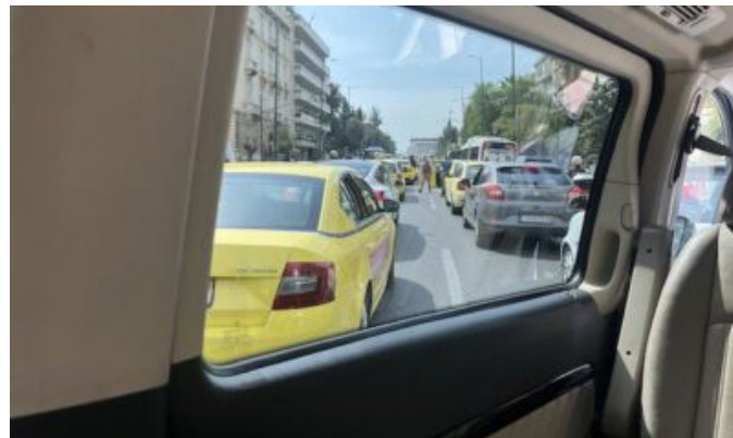
Cab drivers in Athens staged a one-day strike Tuesday, April 15, seeking bus lane usage when they carry passengers.