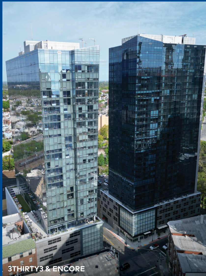
3THIRTY3 & ENCORE