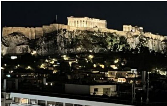
The Acropolis crowned by the Parthenon -- dedicated to the goddess Athena, patroness of Athens -- as seen from the Roof Garden Restaurant at the Hotel Grande Bretagne.