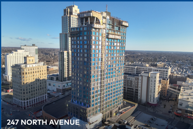
247 NORTH AVENUE