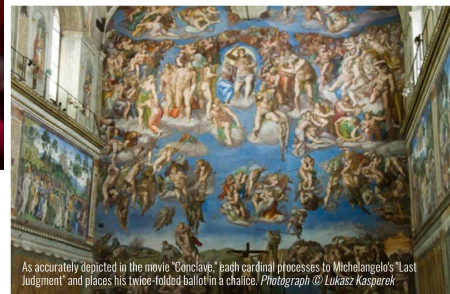
As accurately depicted in the movie "Conclave," each cardinal processes to Michelangelo's "Last Judgment" and places his twice-folded ballot in a chalice.