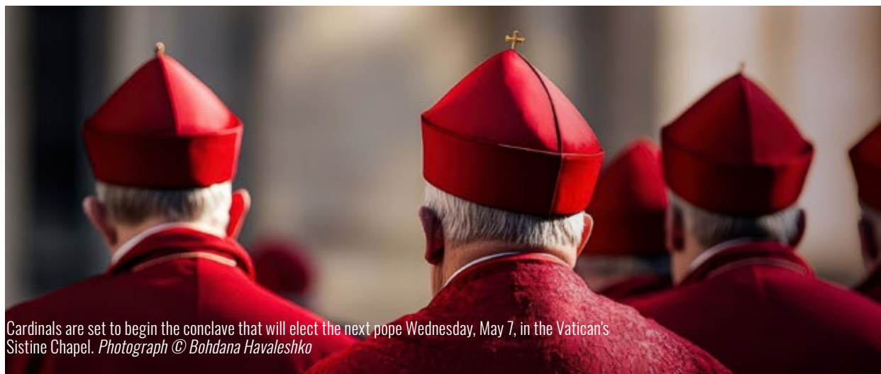
Cardinals are set to begin the conclave that will elect the next pope Wednesday, May 7, in the Vatican's Sistine Chapel.