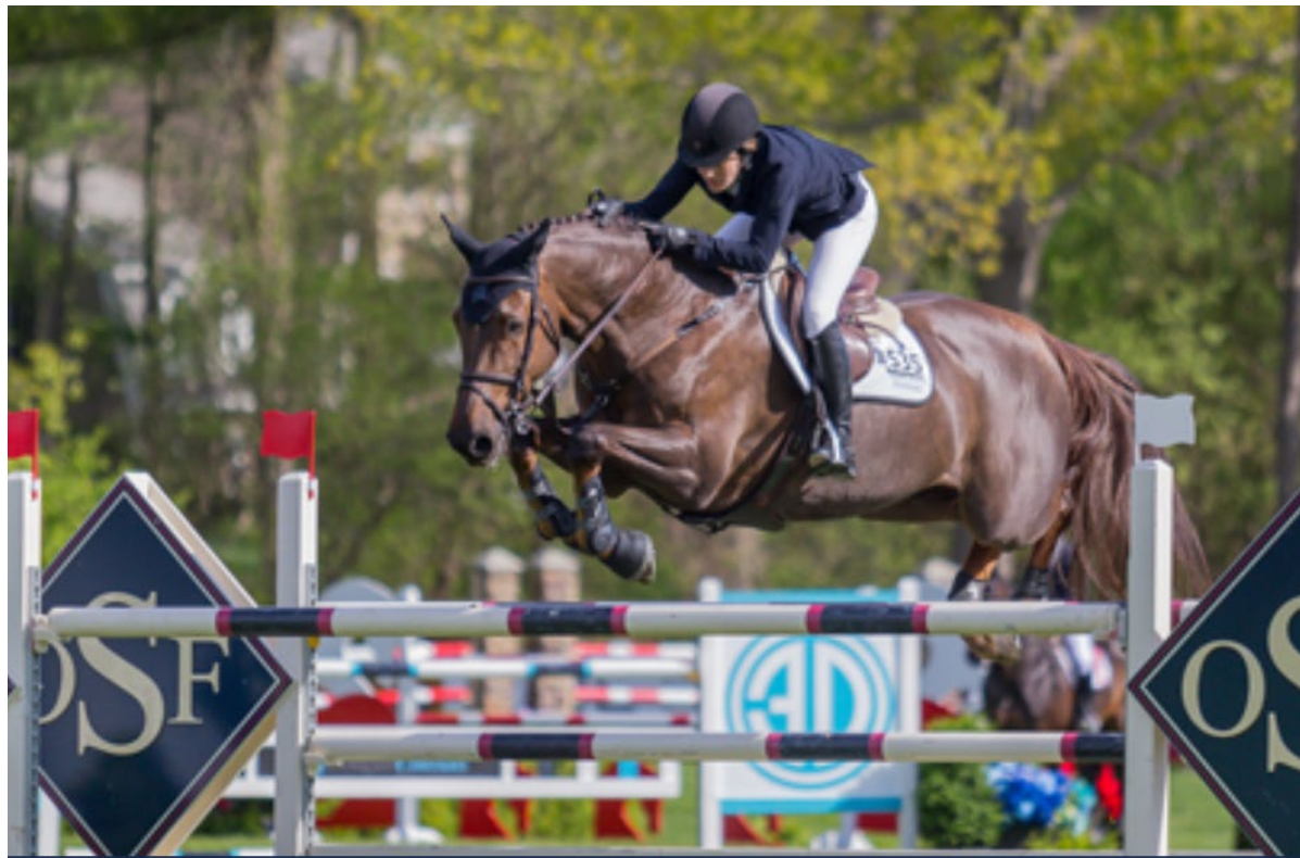
The Spring Horse Shows.

Of course, such philanthropic partners as well as food and retail vendors are but the setting for events like the $135,000 Grand Prix presented by The Kincaid Group (May 11) and the $225,000 Empire State Grand Prix presented by Old Salem Farm (May 18). Among the stars you can expect to see in action are two-time gold