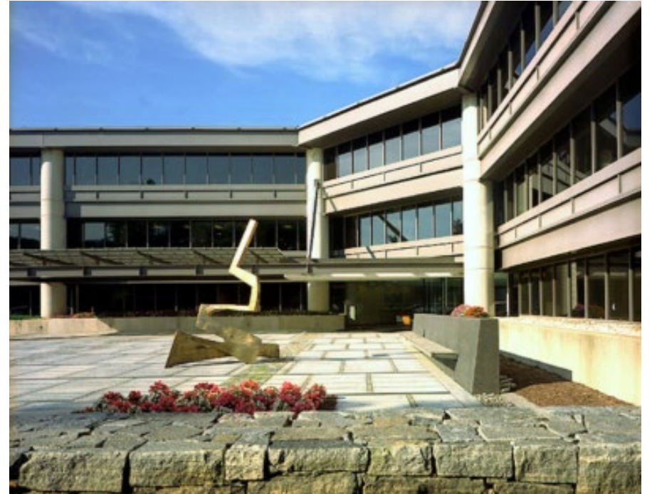
187 Danbury Road in Wilton.

ucation, which will take up the first two floors, is dedicated to empowering children to explore, discover, and grow with confidence, creating meaningful experiences and a supportive community to build a strong foundation for lifelong learning and success.