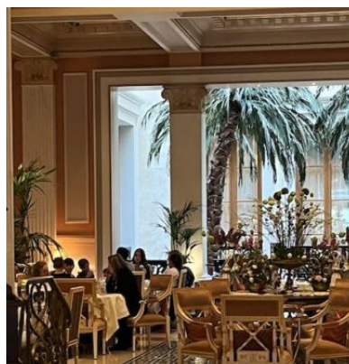
The Winter Garden Restaurant at the Hotel Grande Bretagne.