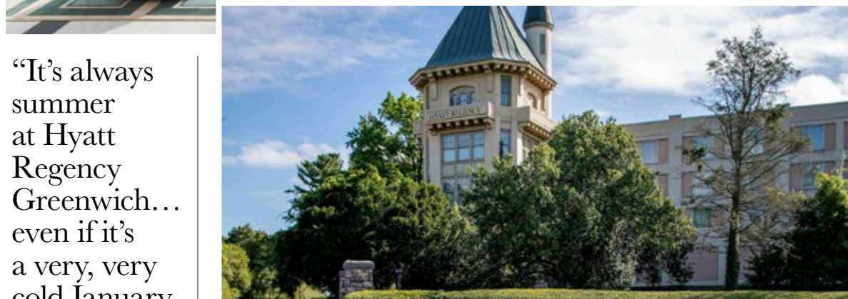
Hyatt Regency Greenwich water tower.

"It's always summer at Hyatt Regency Greenwich... even if it's a very, very cold January day."