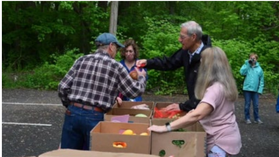
Volunteers sort through vegetables for Connecticut Foodshare.

— Erick Russell, Connecticut State Treasurer