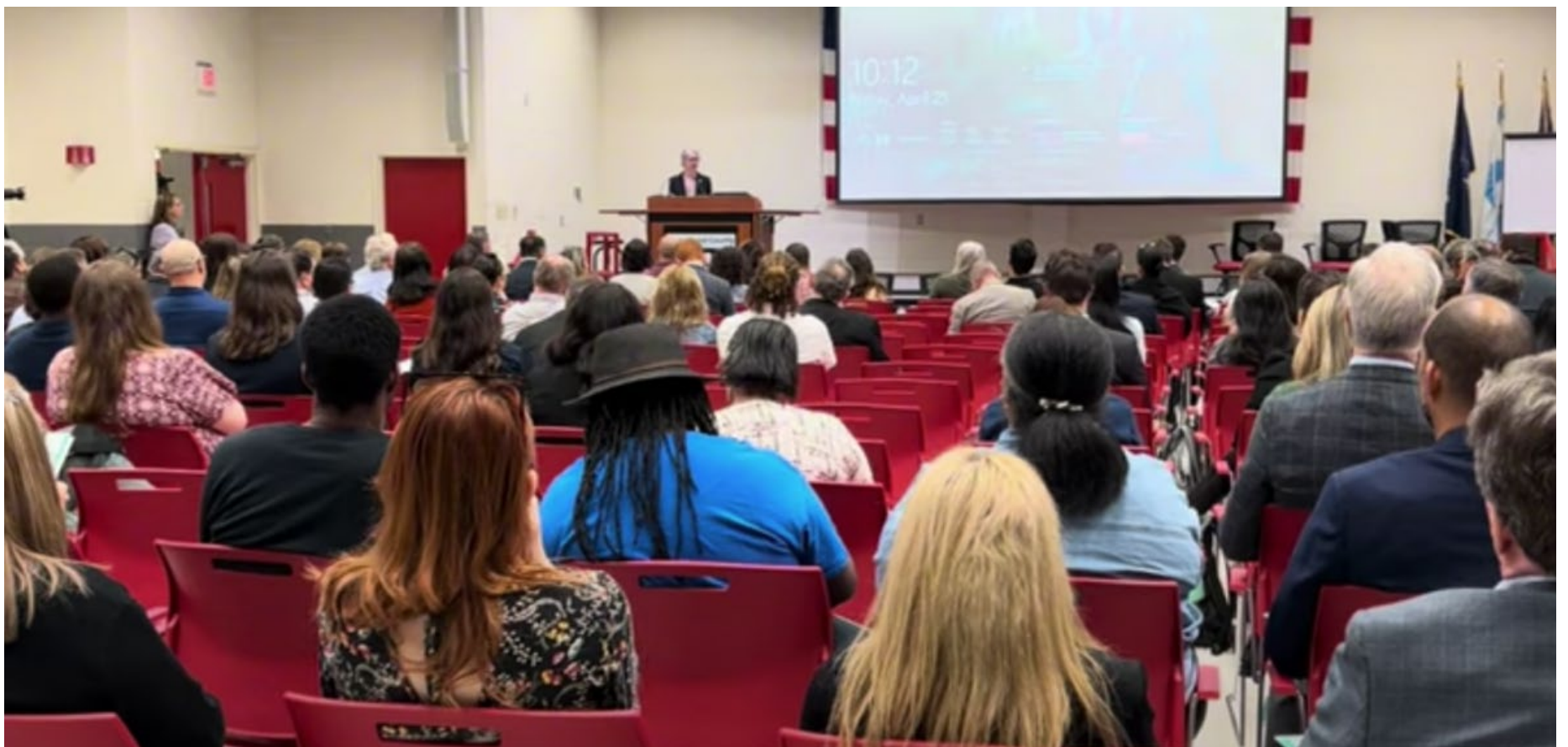
Rockland Housing forum.