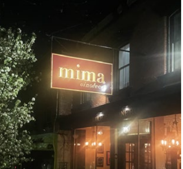
Mima at night.

We moved from negronis to glasses of Cardedu red wine, "Monica," from