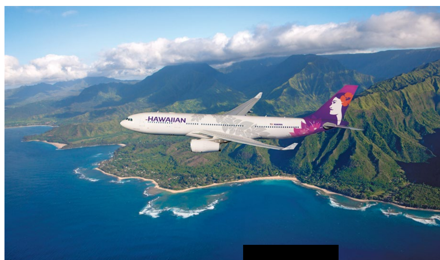
Hawaiian Airlines' new 300-seat 787 Dreamliner features a new class of premium service – 34 Leihōkū Suites for the ultimate in luxury.

These efforts overlapped an already-existing Hawaiian Airlines program to encourage responsible tourism in Hawaii, "Travel Pono," to preserve Hawaii's natural resources, cultures and communities. Special videos to this effect are played on the seatback video screens on the takeoff and landing of every Hawaiian Airlines flight. They encourage "voluntourism" activities such as cleaning up beaches, planting seedlings for new trees and vegetation, clearing out invasive/destructive species at Haleakala National Park and packing goods at Maui Food Bank.