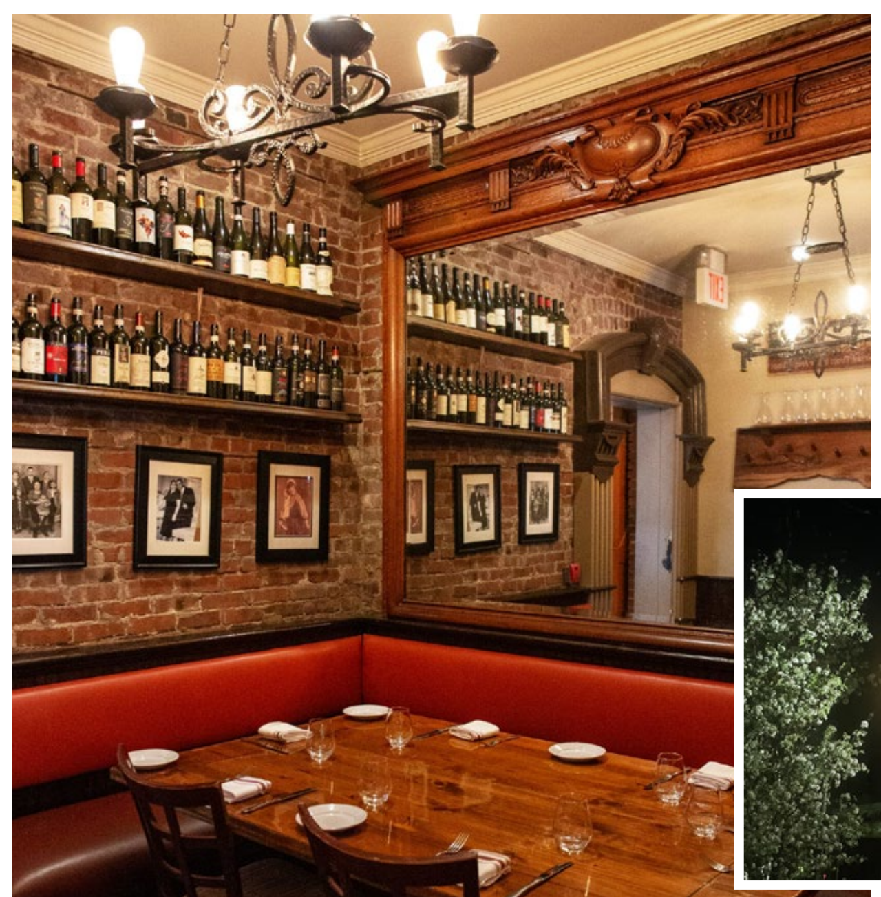
Photo courtest Mima Vinoteca: Italian Restaurant & Wine Bar - Irvington, NY

Inside, the 16-year-old restaurant looked full to bursting and I said a silent prayer: Please, please, please have a table. We were greeted by a manag-