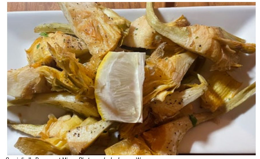
Carciofi alla Romana at Mima.

er. "Any chance of a table for two?" I whimpered. "Absolutely," he said, and somehow, out of nowhere, whipped up the last table in the restaurant, which also happened to be one of the best.