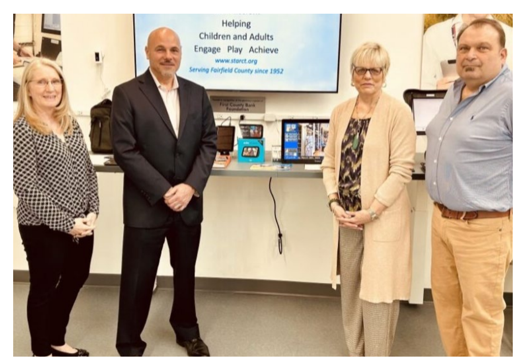
Bank officials present Star Inc, Lighting the Way with grant.