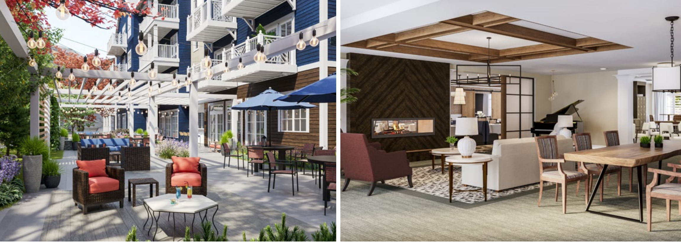
Renderings of the courtyard and lobby of the BrightView Senior Living complex, opening in West Harrison in late summer, early fall.