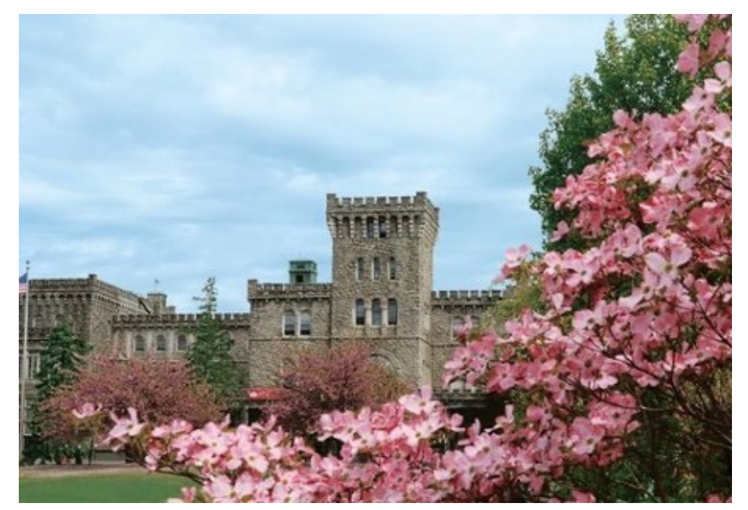
The castle at Manhattanville University.