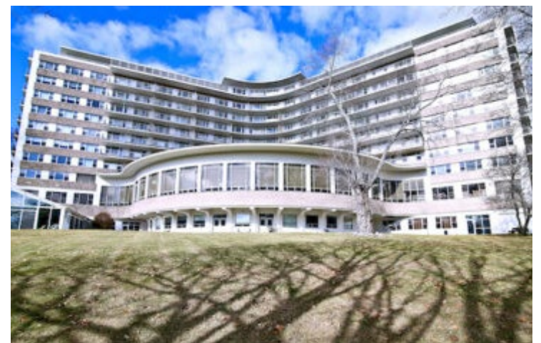
▲ The retirement community at 3030 Park in Bridgeport is one of two that are now under new management.

River Valley. It is situated next to Heritage Village, a residential and golf community. The community's residential buildings, connected by covered bridges, include 130 Independent Living apartments along with 51 assisted living apartments, 14 memory care studios, and a 34-bed skilled nursing facility and rehabilitation center.