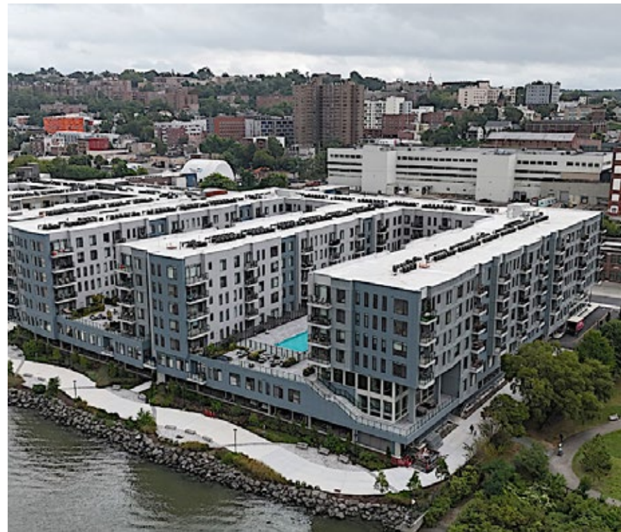
Alexander Crossing in Yonkers.

The Yonkers Industrial Development Agency had approved a package of financial incentives for the approximately $177 million project on 6.16 acres of land along the riverfront. Rose Associates had purchased the property from Altman Stage Lighting Co.,