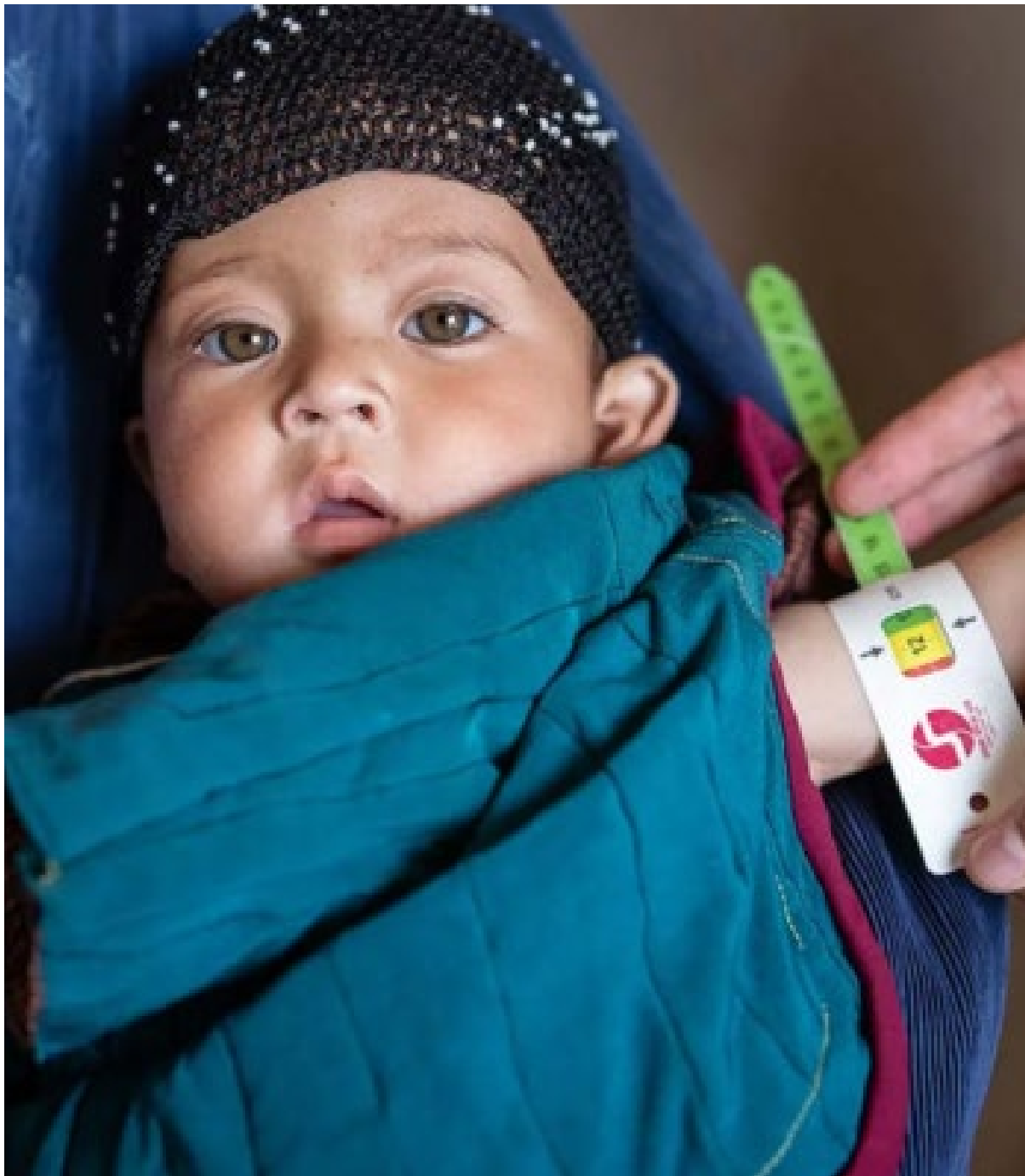
Save the Children, based in Fairfield, and AmeriCares, based in Stamford, are facing big funding shortfalls thanks to the elimination of contracts and funds from USAID.

“The U.S. administration’s abrupt termination of foreign assistance puts lives on the line and futures at risk,” AmeriCares stated in a recent release. “Humanitarian assistance increases access to health care for people in the