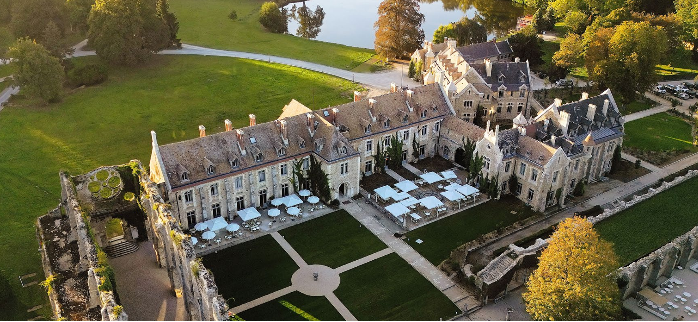
Aerial view of L'Abbaye des Vaux-de-Cernay.