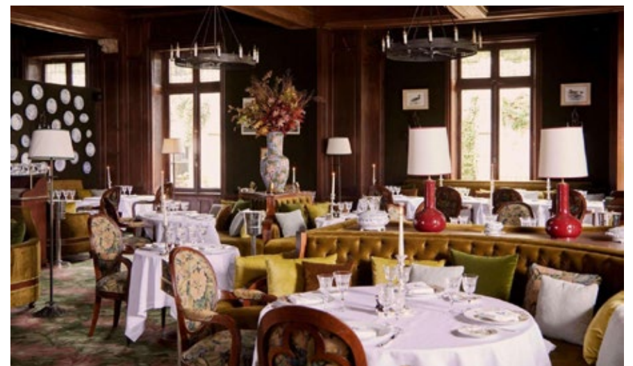
Les Chasses restaurant.