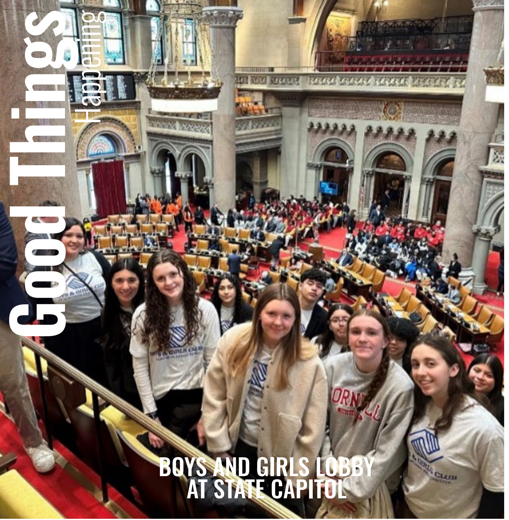
Members of the Boys & Girls Club of Northern Westchester visit Albany to lobby for funding for youth services.

The Boys and Girls Club of Northern Westchester visited law-makers at the State Capitol in Albany on Jan. 30 for Afterschool Advocacy Day to lobby for important afterschool programs and services