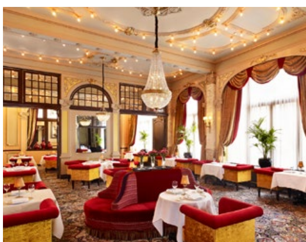
Hotel des Indes dining room.