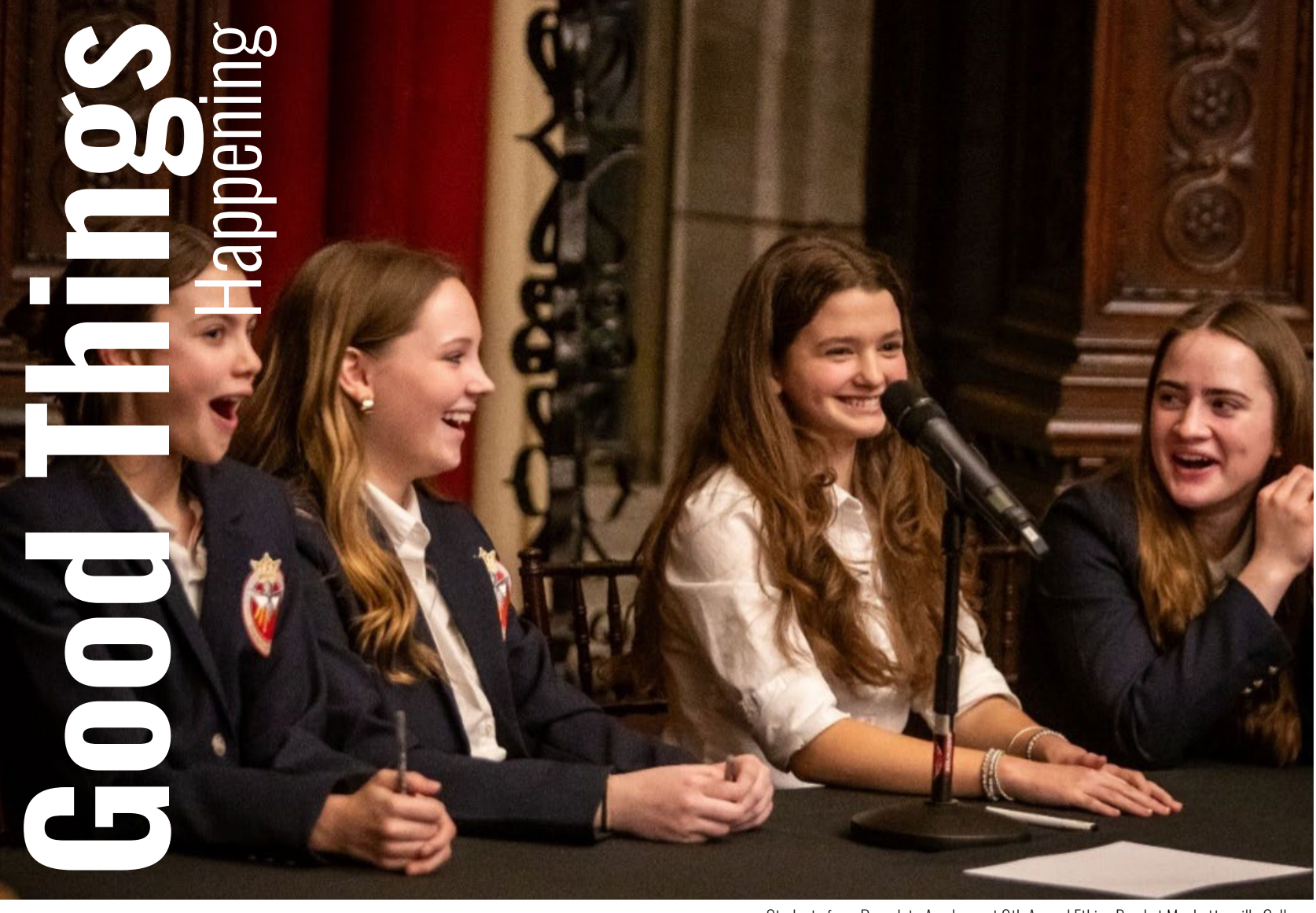
Students from Paraclete Academy at 9th Annual Ethics Bowl at Manhattanville College