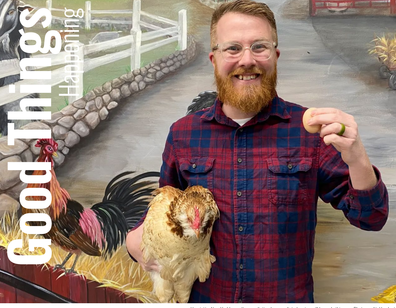
Henrietta, New York's weather-predicting hen, predicted spring will be early this year.