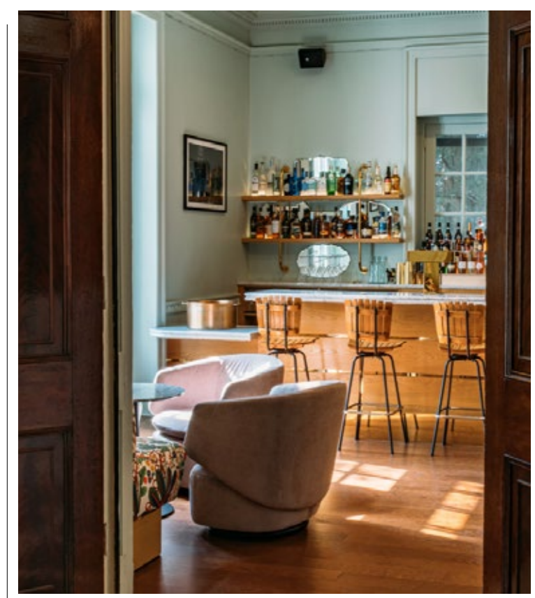
Goosefeather interior.

Up in Milford, Lao Sze Chuan https://www.laoszechuanmilford. com/ will be preparing à la carte New Year specials, including appetizers of razor clams and Beijing-style braised beef shank and such main courses as not-to-be missed lobsters