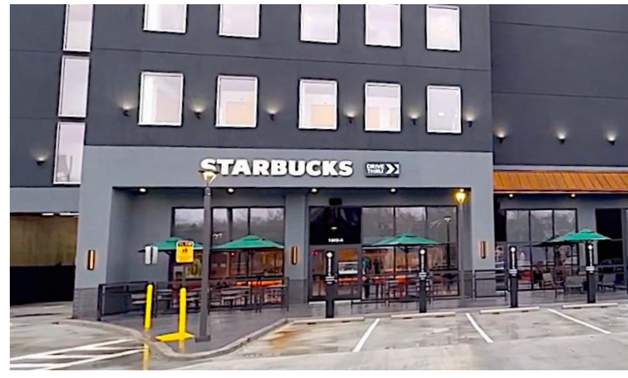
Starbucks at left of retail space at 1969 Central Park Ave., Yonkers.

The five-story self-storage building was constructed on an approximately 1.32-acre parcel by 1969 Central Park Avenue. LLC. It contains approximately 92,181 square feet of space. The ground floor retail units have a total of 5,815 square feet of space. The $21 million project received financial incentives from the Yonkers Industrial Development Agency that