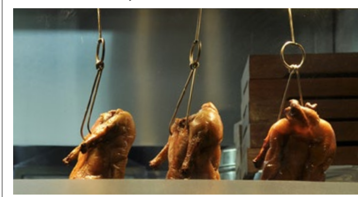
Peking ducks at OMandarin.

Bi Feng Tang (with green and red peppers); spicy pot with rack of lamb; frogs legs; and the delicacies that are sea cucumbers and abalone. A New Year Bundle – a feast serving four or more – will also be available.