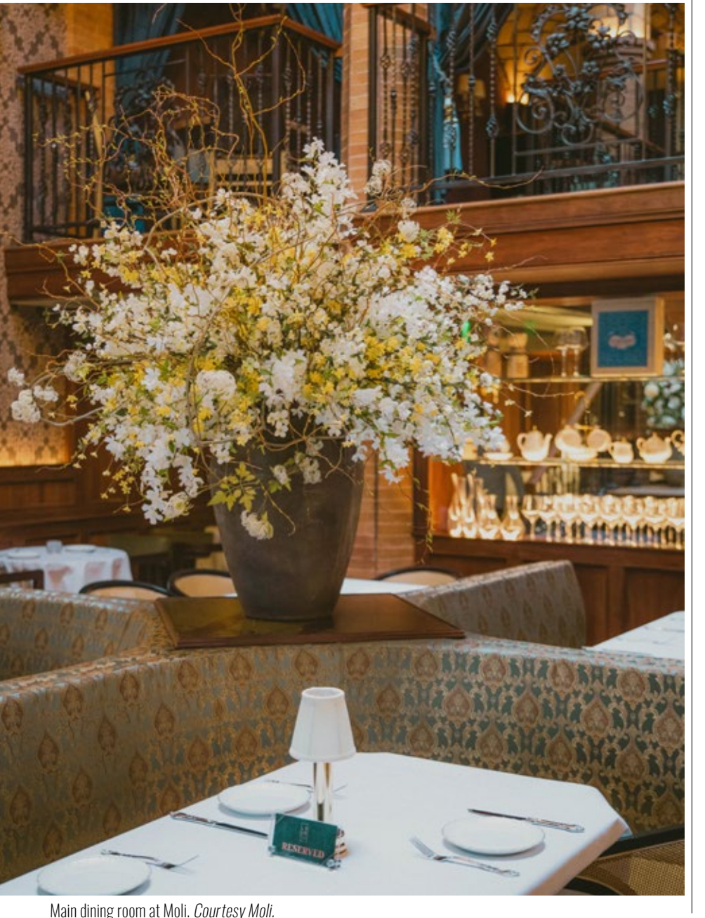
Main dining room at Moli.

Welcome the Year of the Dragon at these area Chinese restaurants.