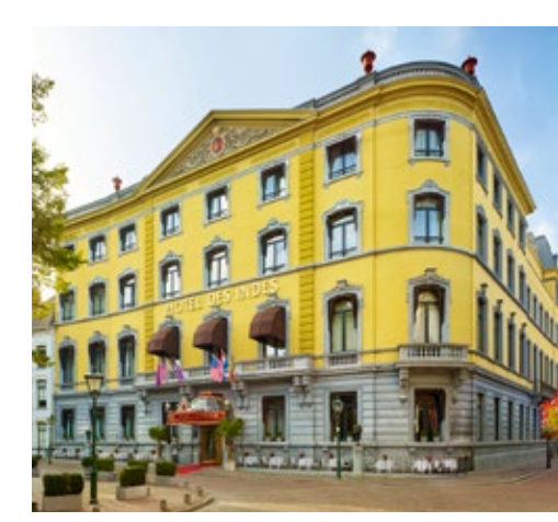
Hotel des Indes, exterior.