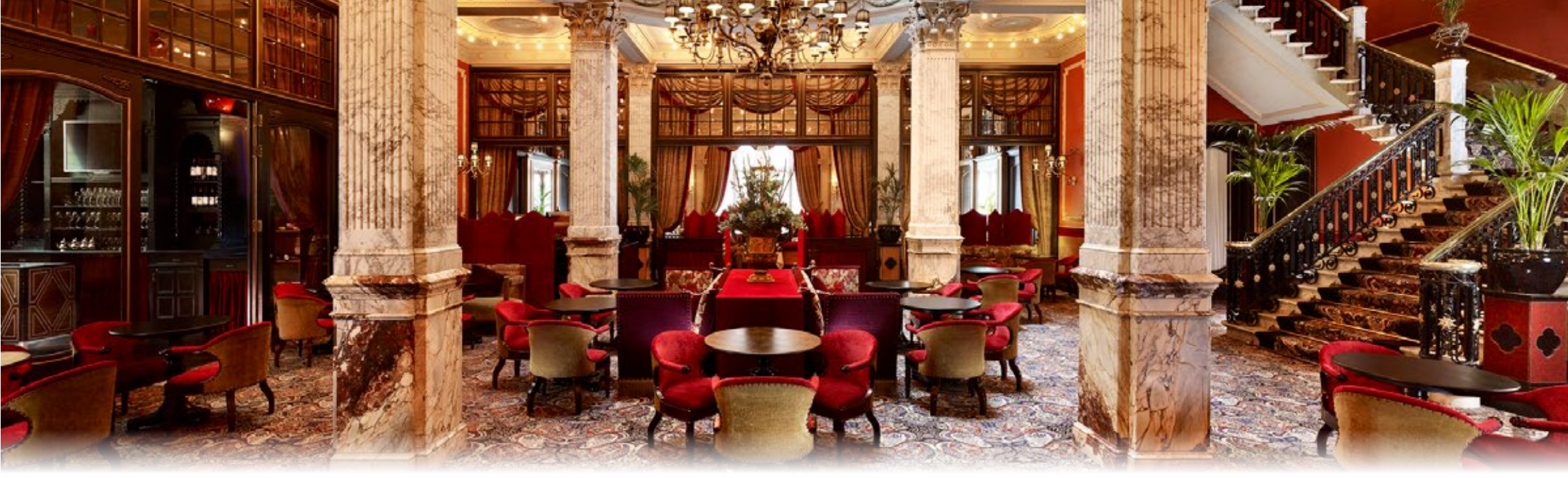
Hotel des Indes lobby.