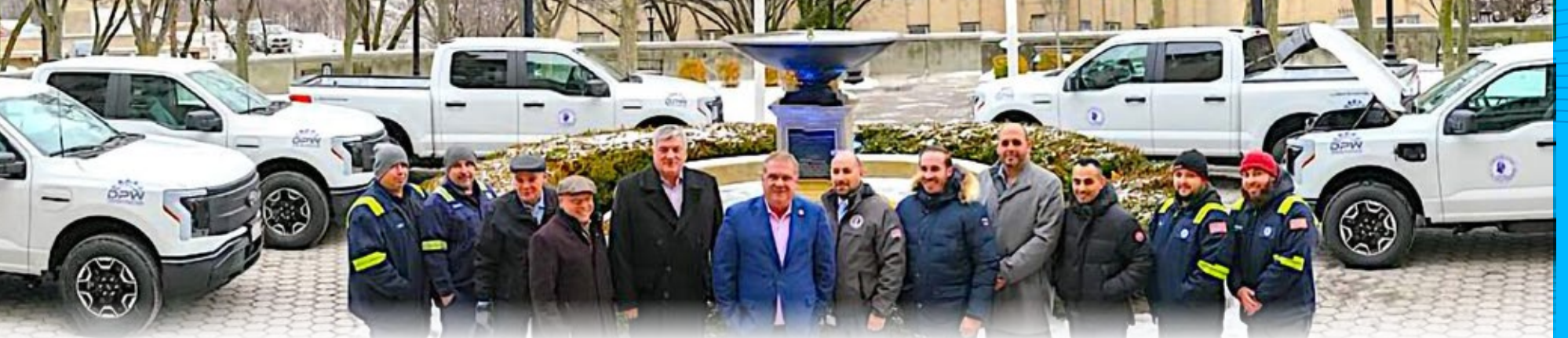
Mayor Spano, center, joins Yonkers DPW personnel to unveil new electric vehicles at City Hall